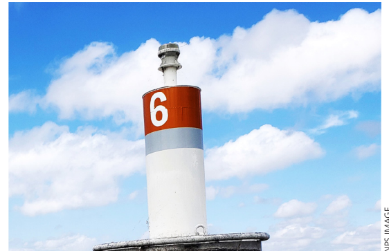
Buoys mark the historic riverbed of the Rio Grande, which is also the international border.

Additional information about boating on Lake Amistad are available at https://go.nps.gov/amis/boating . Links to both USA/Texas and Mexico regulations will be updated there as available.