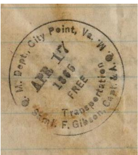
APCO 11546-01 Lt Thompson Parole Pass (transport stamp detail)