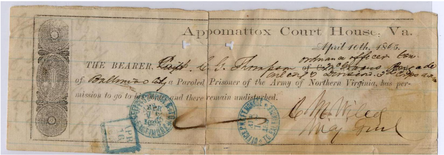
APCO 11546-01 Lt Thompson Parole Pass (front)