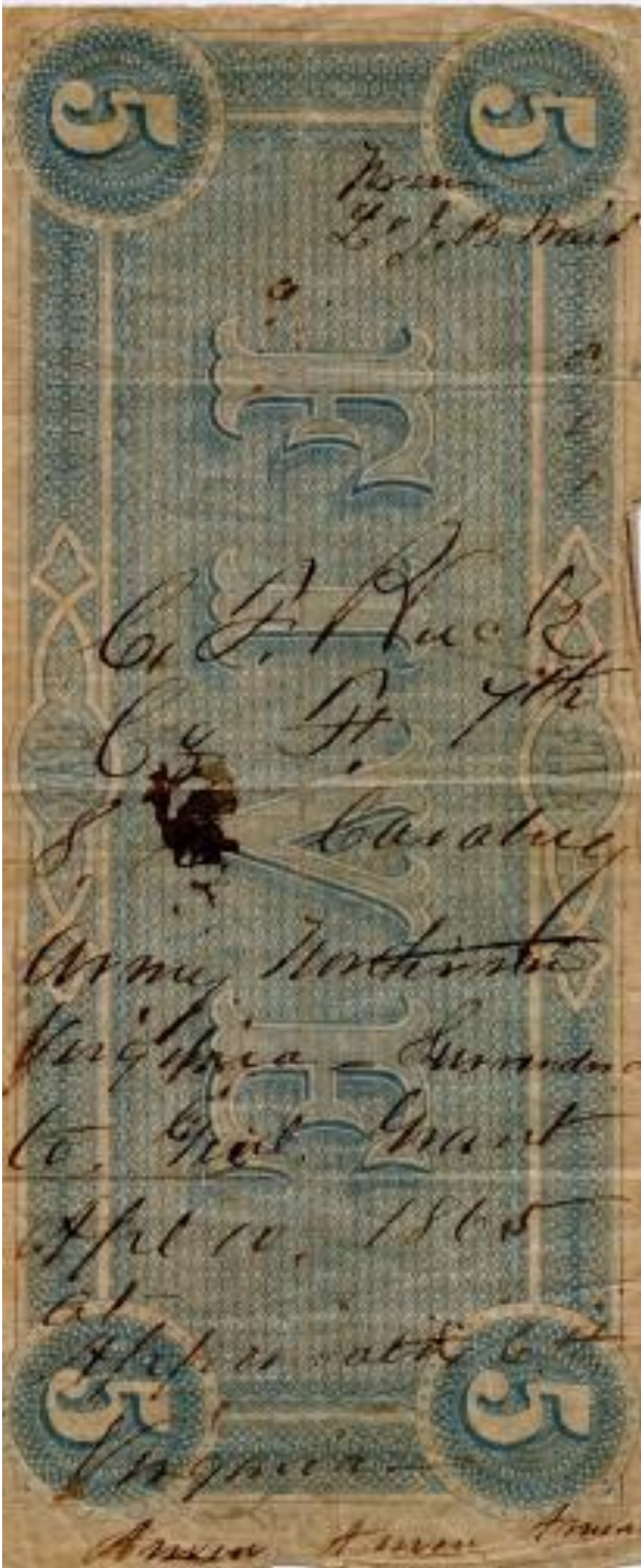
APCO 4020-01 Ruck Parole Pass on CSA Five Dollar Bill