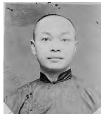
The identification photograph submitted by Wong Kim Ark with his departure statement (May 1904), confirming that he was a native-born citizen of the United States and intended to facilitate his reentry into the country.

Wong Kim Ark was a native born American citizen of Chinese descent whose 1898 Supreme Court challenge affirmed the constitutional status of birthright citizenship for all persons born in the United States despite the immigration status of their parents. A restaurant cook and native of San Francisco, Wong was 24 in 1894 when he returned to California after a visit to China. To his surprise, he was denied entry into the United States.