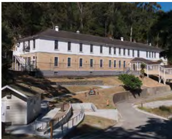
Detention Center, Angel Island Immigration Station in San Francisco Bay, May 2013.

With such deep-rooted and passionate racism circulating in towns and cities in the U.S. West, it was common for Filipinos to be victims of violence by both