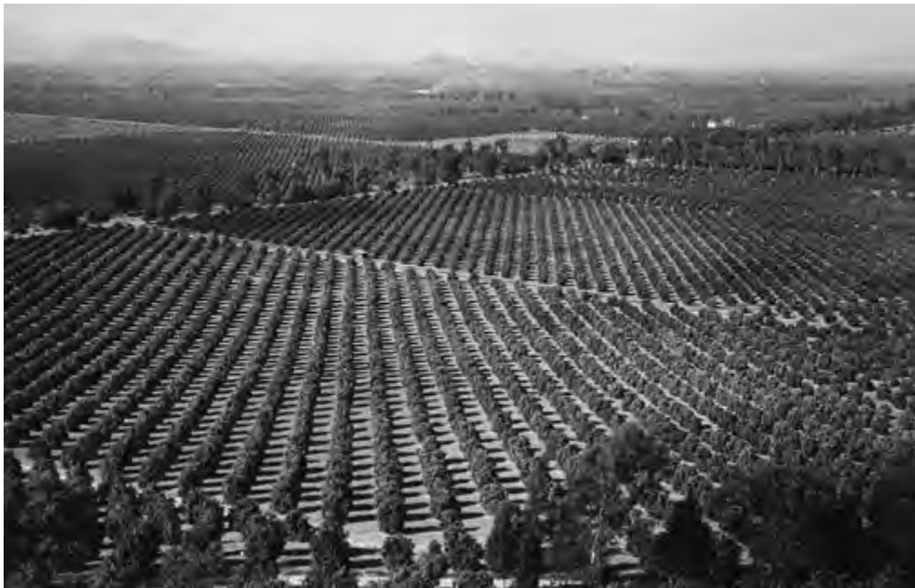
A view of the Arlington Heights citrus groves in Riverside, California, where the agricultural development of the region by Asian laborers transformed California into a premier citrus producer in the twentieth century, 1968.

Huge dreams of fortune Go with me to foreign lands Across the ocean