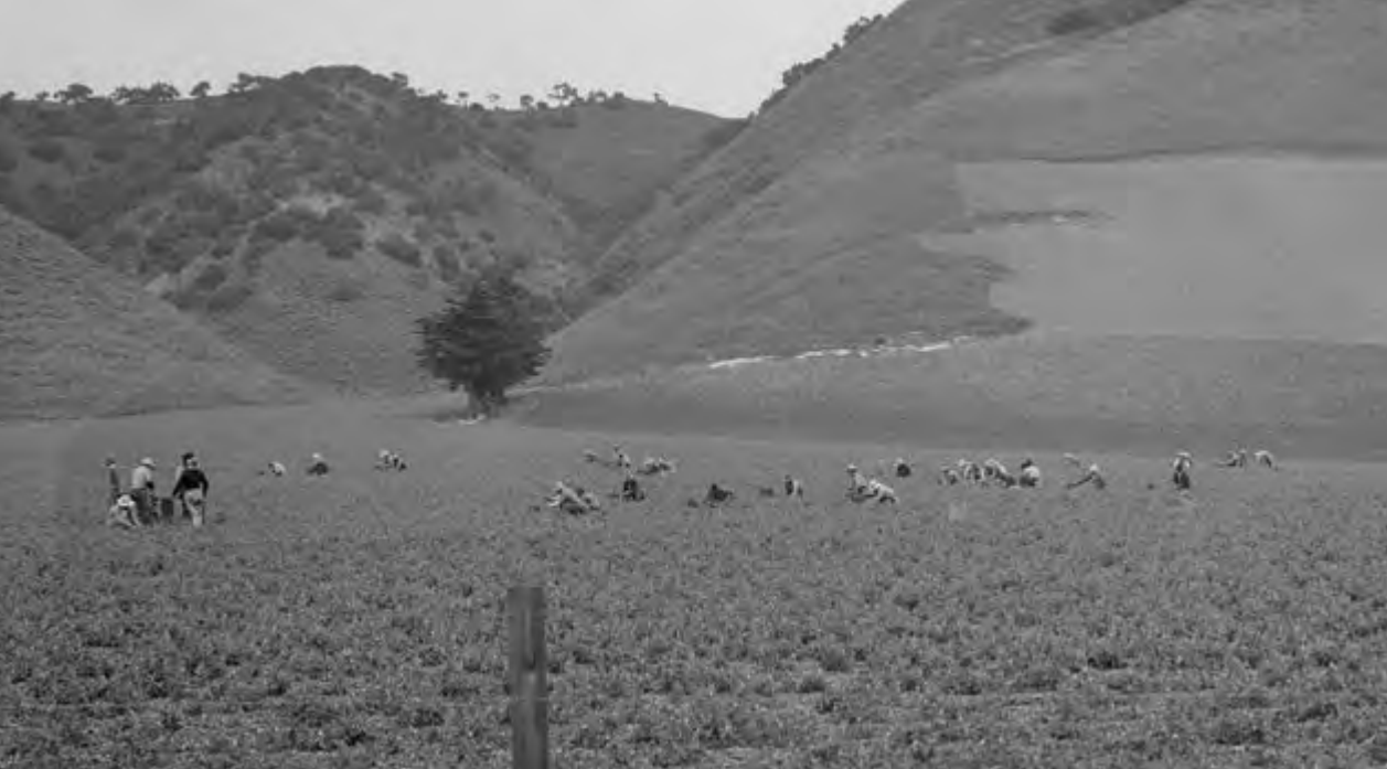
Filipino gang labor in a Japanese-owned pea field near Pismo Beach, California, 1936.

relatives and matchmakers back home to introduce them to suitable wives. To convince their prospective brides that they were a good match, they often sent photographs of themselves in western suits in front of fancy American cars and big houses. What the women who received these photos did not know was that the suits were borrowed, the backdrops were staged, and the photographs themselves were often years old. Buoyed by high hopes, many “picture brides” had their expectations dashed when they finally arrived in the U.S. and found their husbands to be older and poorer than they had represented themselves to be. The reality of their harsh lives in the United States also often led to life-long disappointments and difficult, if not failed, marriages. But with grit and perseverance, these early issei raised their families and helped form a vibrant Japanese American community before World War II.