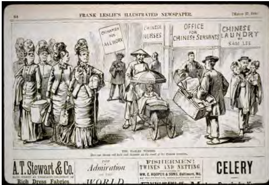
"The tables turned - how our streets will look next year as a result of the Chinese invasion." A caricature shows a Caucasian women standing idle as Chinese men advertise themselves as babysitters, launderers, and servants, 1880. Drawing published in Frank Leslie's Illustrated Newspaper ; courtesy of the Library of Congress.

Act prohibiting the entry of Chinese laborers into the United States and allowing only select "exempt" classes of Chinese (merchants, students, teachers, travelers, and diplomats) to enter the country. It was the first time in U.S. history that the federal government had enacted such broad restrictions on immigration based on race and class.