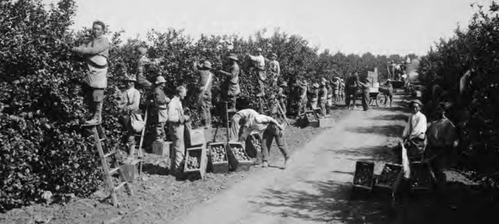
Workers harvest oranges in the Arlington Heights citrus groves, 1968.

Family fortunes Fall into the wicker trunk I carry abroad. 4