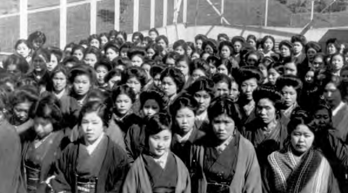
Japanese picture brides arriving at Angel Island, California, c. 1910. Between 1909 and 1920, the largest number of Japanese to come to the United States were so-called "picture brides," young women in Japan who had been arranged in marriage to Japanese immigrants in the United States. Photo courtesy of California State Parks. Image 090-706.

the anti-Japanese movement, one that focused on the so-called "Yellow Peril" of Japanese immigration, began.