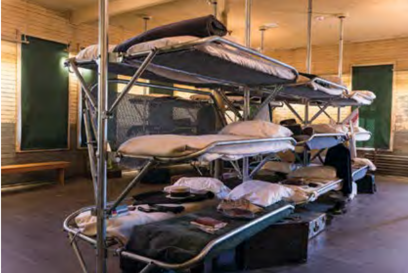
Interior of the men's dormitory at the Angel Island Immigration Station in San Francisco Bay, California. May 2013.

fornia's Mexican era. After the U.S.-Mexican war, the U.S. turned Angel Island into a military base. In 1904, the federal government began constructing an immigration station on the island.