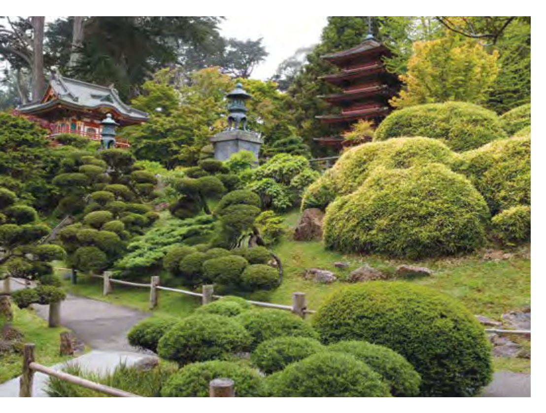
Japanese Tea Garden, Golden Gate Park, San Francisco. The garden was designed by Japanese landscape architect Makoto Hagiwara.

Beyond the design and maintenance of formal gardens and related structures, Japanese immigrants played