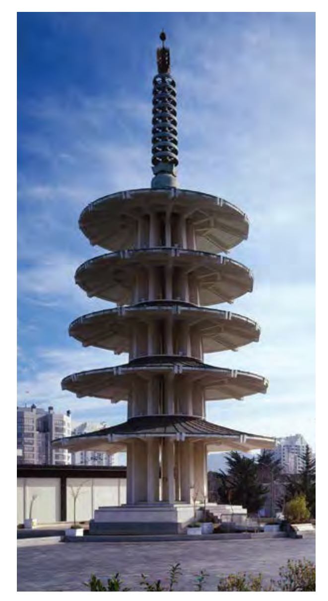
The Peace Pagoda stands 100-feet-high at the entrance to San Francisco's Japantown. Designed by Japanese architect Yoshiro Taniguchi, it was presented to the city by its sister city Osaka on March 28, 1968.

Many didn't return to their prewar homes and communities, instead making new lives in the places where they had temporarily resettled to avoid internment, or to which they were released for work or study before the end of the war. All of these factors contributed to a decline in the vitality and population of Nihonmachi that had been vibrant before the war. This decline also was fueled by the acceleration of suburban growth in the 1950s and 1960s, raising new questions about what role