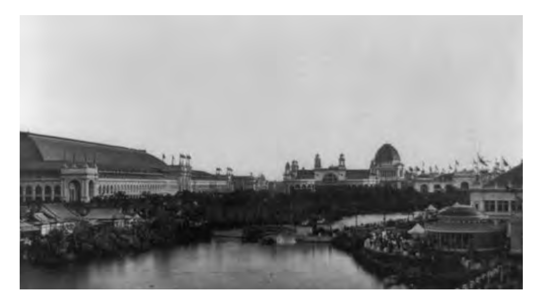
A view of the 1893 Chicago World's fair; the roofs of the Japanese exhibition buildings can be seen on the far left. Photogravure produced by D. Appleton and Co.; courtesy of the Library of Congress.

as Phoenix Hall), along with a Bazaar and Tea House sponsored by the Tea Merchants Guild of Japan, used the same process of building assembly, but symbolically elevated the role of a professional architect, Masamichi Kuru (1848-1915), over the skills of master carpenters.<sup>5</sup>