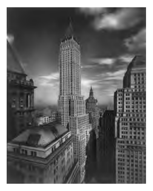
The Bank of Manhattan Trust Building, now the Trump Building at 40 Wall Street, is a 71-story skyscraper originally designed by H. Craig Severance and Yasuo Matsui. It was the tallest building in the world for a short time before the completion of the Chrysler Building in Midtown Manhattan.

In partnership with landscape designer Takeo Shiota (1881-1943), whose most publicly acclaimed project was the Japanese Hill-and-Pond Garden at the Brooklyn Botanical Gardens in 1914, Tsumanuma/Rockrise undertook an elaborate interior design for one of the era's most notable Japanophiles, Burton Holmes. A globe-trotting lecturer known for having "invented" the travelogue, Holmes was seeking a temple-like setting within his two-story Central Park apartment to house his extensive collection of mementos. Well documented, the project illustrates the contradictions inherent in the American Japan craze, requiring the deployment of Asian aesthetic tropes in service of distinctively American cultural objectives.