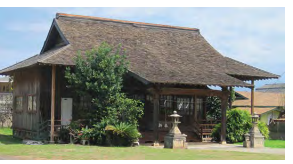
The Jinsha Mission shrine is the only major Shinto shrine in Maui and one of the best preserved examples of the traditional shrine-building techniques employed by Japanese carpenters.

of miyadaiku , specialists in shrines and temples, whose capacity to produce fine joinery was combined with a knowledge of Shinto ritual. It is the last extant example of Inari Shrine architecture on O'ahu.