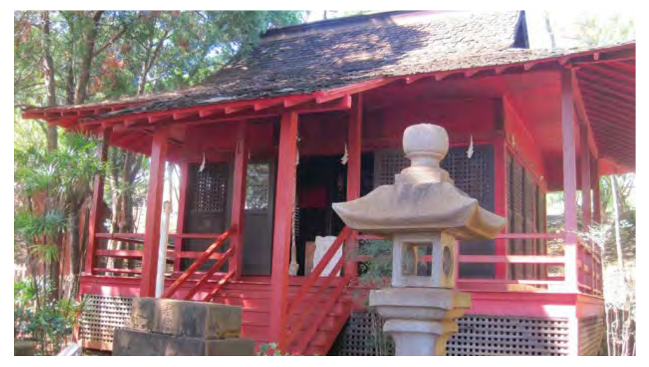
The Wakamiya Inari Shrine in Waipahu, Hawai'i, was painted bright red in reverence to Inari, the Japanese god of foxes, agriculture, industry, and prosperity.

Underlying the construction of shrines used by followers of the Shinto religion, for example, was the shrine carpenter's knowledge of religious practices, including rituals performed at successive stages of building. This was certainly true for the Nikkei carpenters who built Wakamiya Inari Shrine in 1914 in an industrial area of Honolulu.<sup>9</sup> Founded by Shinto priest Yoshio Akizaki, the shrine is attributed to a Japanese architect by the name of Haschun, possibly an inaccurate transcription of Hokushin, one of two carpenters working in Honolulu in the period. Although little is known about the earliest phases of its design and construction, it could not have been built without the carpentry skills