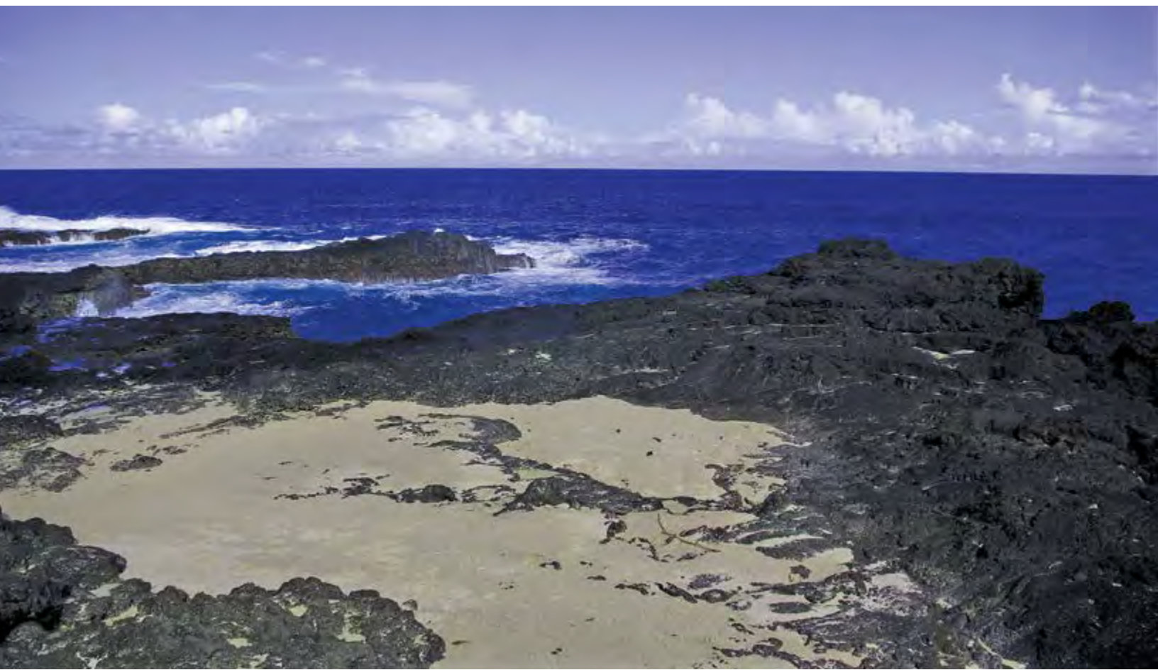
Laumei ma Malie (Turtle and Shark) was listed in the National Register of Historic Places in 2014 as a natural feature significant to the people of American Samoa and for the maintenance of their cultural and historical identity. It is where a scene of a powerful Samoan oral narrative took place that is reenacted today by villagers of Vaitogi, who perform a song calling turtle and shark to surface from the ocean.

In the state of Hawai'i and insular areas of American Samoa and Guam, modern historic preservation