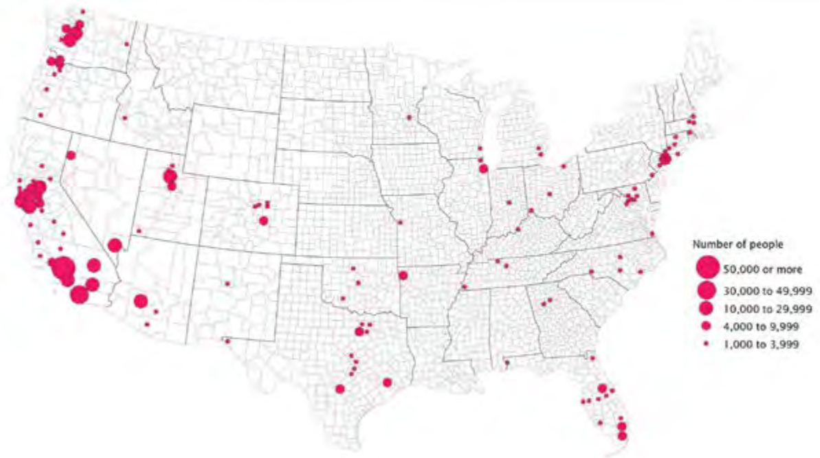
2010 census data showing US counties with populations of more than 1,000 Native Hawaiian and other Pacific Islanders. Note that US Pacific Island commonwealths and territories are not included. Map Courtesy of the U.S. Census Bureau, 2012.

or scientific data-gathering populations. 5