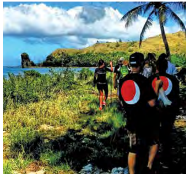
Fouha (Fuha, Fu'a) Bay in Guam is recognized as a site important to the Chamorro creation narrative of the sister and brother, Fo'na and Pontan (Fu'una and Puntan). It was included in the Guam Register of Historic Places and the National Register of Historic Places in 1974. The ancestral tradition of procession to sacred sites, such as this, to honor ancestors and place offerings has been revived in recent years.

Some of these complex layers have been documented and registered as Pacific Islanders and others strive to maintain, protect, and better understand them; at other times, Pacific communities have preferred to achieve