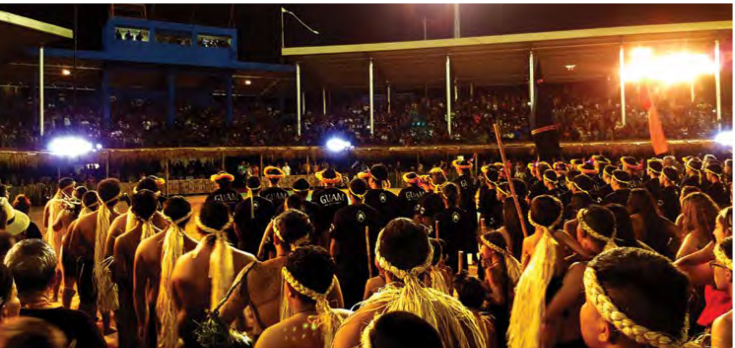
Five hundred Guam delegates stand together at the 12th Festival of Pacific Arts opening ceremony on the evening of 22 May 2016. Hosting this festival, perhaps more than any other singular event in modern times, reaffirmed Guam’s Chamorro cultural identity. Its revitalization in recent years has increased the visitation to and protection of ancestral sites on the island.