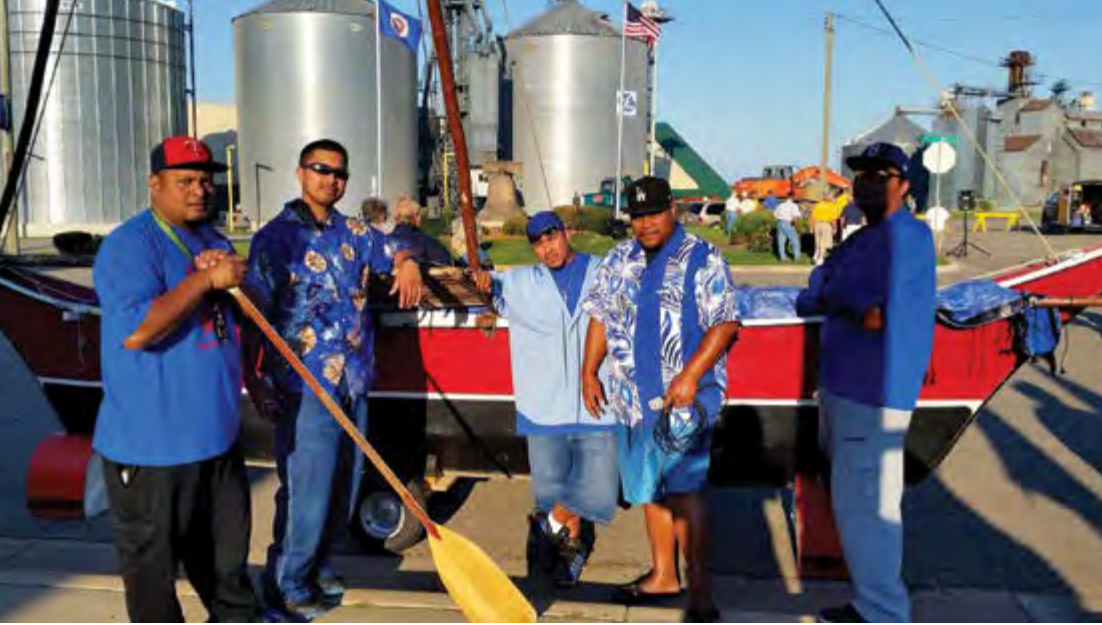
The highlight of the celebration for the replacement of the town's Liberty Bell replica in Milan, Minnesota, was a two-float parade consisting of a Viking ship denoting Milan's Norwegian heritage and an outrigger canoe, the latter seen here, representing an important aspect of Chuukese traditional culture.

these goals through bolstering traditional practices such as reinstating or maintaining ceremonies, processions, and transmission of knowledge. Unfortunately, these ancestral layers are sometimes silenced by highlighting modern historic events, destroying or removing tangible ancestral heritage, or limiting access to them. For Pacific Islanders, in contrast to many western views, these actions do not necessarily impact the integrity of the power or essence of an ancestral site. For example, the military bulldozed particular sets of latte , two-piece Chamorro stone house pillars, sometime around the 1950s; they were relocated to various sites on Guam. The latte , however, are still visited by Chamorros to connect with ancestral spirits. Further, the dislocated latte , rather than losing integrity, now also inform the community of the colonial relationships and attitudes of the time.