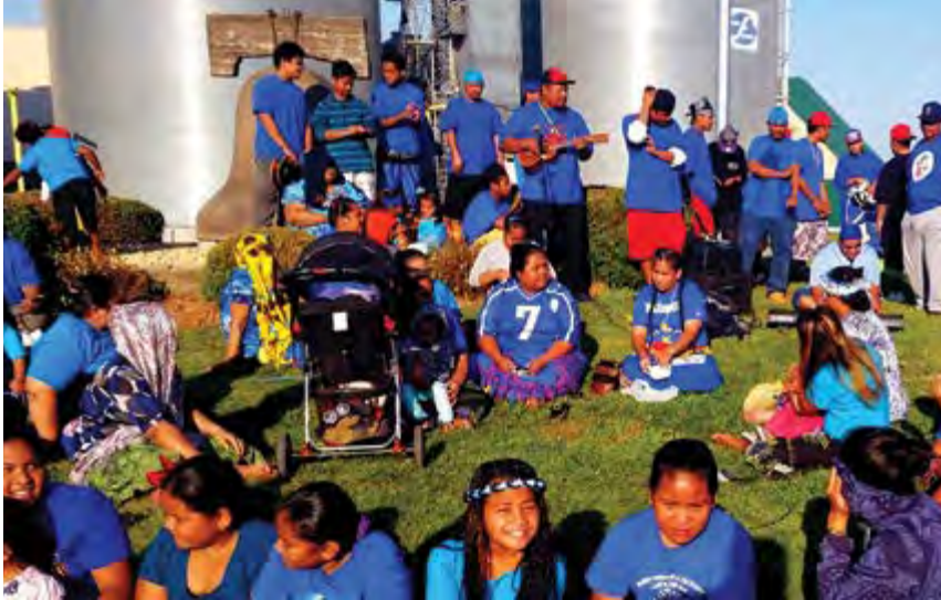
The Chuukese community of Milan, Minnesota, at the dedication of the replacement of the town's Liberty Bell replica in 2016. Participating in the celebration, they sang some of their traditional songs, as shown here.

someplace to stand on earth before he went on to create surrounding islands and life upon them.