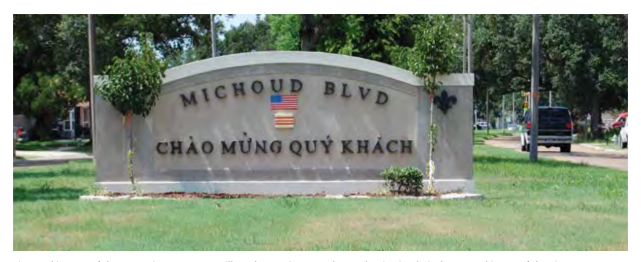
Sign marking one of the two main entrances to Village de L'Est. in New Orleans. The sign is relatively new and is part of the Vietnamese American community's many post-Katrina infrastructure improvements intended to support their cultural heritage.

government and voluntary agencies throughout the country initially aimed to prevent large concentrations of Vietnamese refugees by deliberately dispersing them across the United States. By the end of 1975, most of them were in California, but they also settled in the Midwest with the aid of social service organizations, such as the Lutheran Immigration and Refugee Service, as well as in the South where some found employment in chicken processing plants and nursing homes. Unsurprisingly, refugees left their initial places of settlement in increasing numbers to be closer to family and to seek new work opportunities. This relocation on their own accord (sometimes referred to as secondary migration) created sizable Vietnamese populations in Orange County and San Jose, California, and Houston, Texas. Subsequently, Vietnamese-owned businesses, including mom-and-pop stores as well as big supermarket chains like Wai Wai Supermarkets, fast-food banh-mi shops such as Lee's Sandwiches, and restaurant franchises like The Boiling Crab, proliferated in these areas.