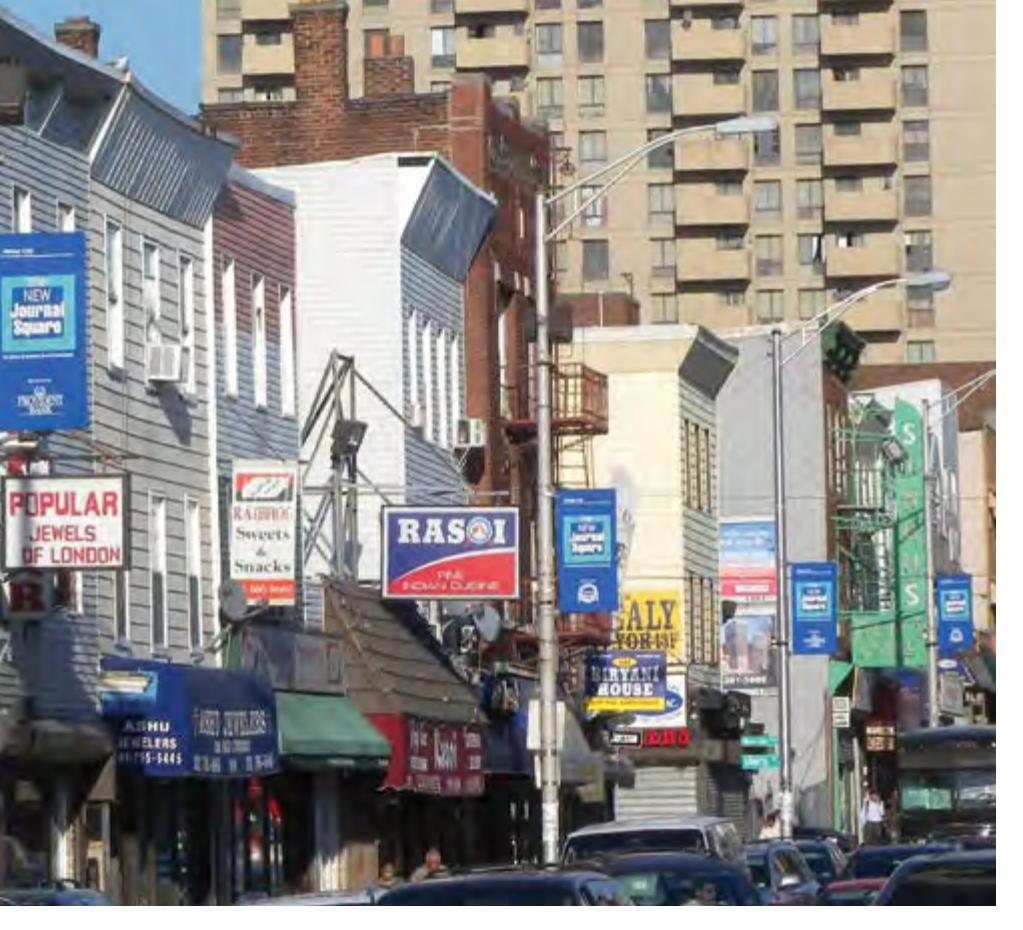
India Square, Jersey City, New Jersey. New Jersey boasts the highest concentration of Asian Indian communities in the western hemisphere.

They practiced various religions including Christianity, Buddhism, Hinduism, and Islam as well as Sikhism.