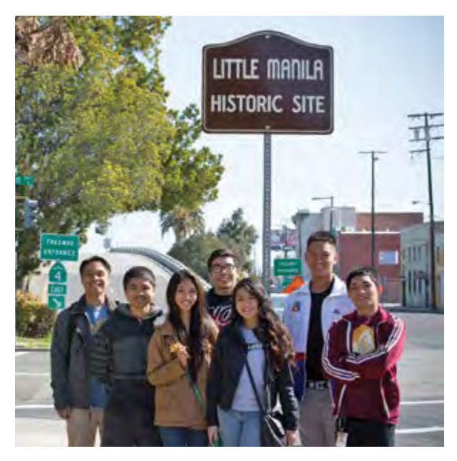
Local high school students now lead tours of the Little Manila Historic Site, located in Stockton, California. At one point, Stockton had the largest Filipino population outside of the Philippines.

The creation of new Filipino communities coincided, however, with the destruction of older ones that were populated by predominantly single Filipino men who had migrated to the United States in the 1920s and 1930s. They had entered as U.S. nationals (a colonial status that enabled them to enter the United States despite restrictive U.S. immigration laws barring Asians) with dreams of furthering their Americanized colonial education. With few exceptions, however, they were relegated