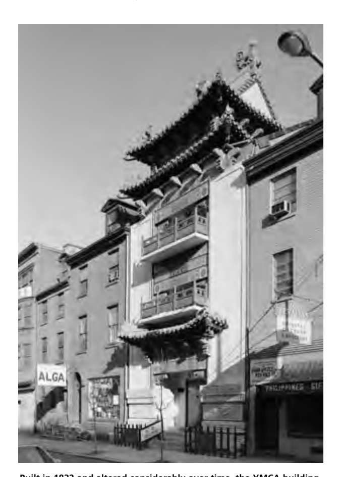
Built in 1832 and altered considerably over time, the YMCA building is an icon in Philadelphia's Chinatown; it once housed the Chinese Cultural and Community Center, but has been closed since 2007.

New Filipino American communities are most visible in places throughout the United States that have