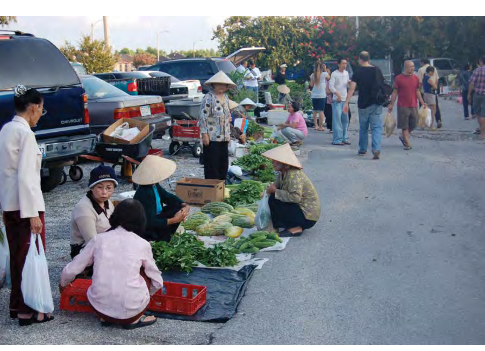
Elderly vendors at the Saturday morning market in New Orleans that has been in existence for 30 years. With the gradual passing of the elderly Vietnamese American population, the number of vendors and cultivators of vegetables has declined.

It is not, however, simply large concentrations of people and businesses that constitute a community. In the American South, a relatively small Vietnamese American community in New Orleans' Village de L'Est became a focal point of national attention after Hurricane Katrina, one of the deadliest hurricanes in U.S. history, devastated the city in August 2005. Although Vietnamese Americans constituted less than 1.5 percent of the city's population, they received inordinate attention from the press as many former residents returned to New Orleans and rebuilt their community in the aftermath of the hurricane.