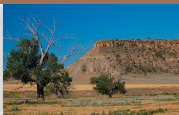
Canyon Creek Battlefield

In addition to Big Hole National Battlefield, Nez Perce National Historical Park includes sites in four states related to nimi-pu history and the events of 1877. Visit White Bird Battlefield (above), where the battles began, and Bear Paw Battlefield (far right), where they ended. Learn more at the visitor center in Spalding, ID, or on the park website. The Nez Perce (Nee-Me-Poo) National Historic Trail also commemorates the flight.