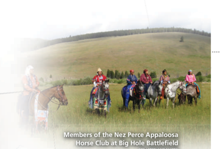
Members of the Nez Perce Appaloosa Horse Club at Big Hole Battlefield