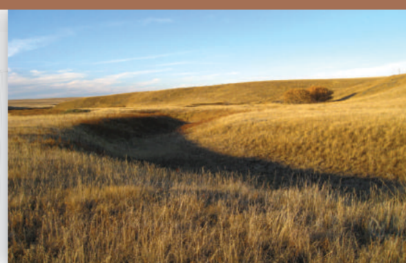
Bear Paw Battlefield

The battle at Canyon Creek (above) took place 10 miles north of present-day Laurel, MT. Most of the battlefield site is on private property, but Nez Perce National Historical Park maintains an outdoor exhibit at the junction of MT 532 and 401 and provides information about the battle on its website.