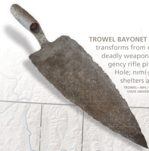
TROWEL BAYONET This sharp trowel transforms from digging tool to deadly weapon. Soldiers dug emergency rifle pits with them at Big Hole; nimi-pu dug emergency shelters at Bear Paw.