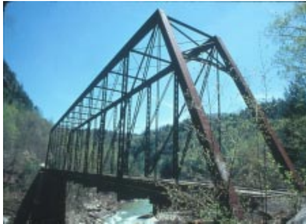
The O&W Bridge can be reached by driving or hiking.

The solitude and isolation were not to last forever, as the Industrial Revolution finally came to the Cumberland Plateau. The region's rich timber and coal resources were basically untapped in the early 1900s, and the nation's industrialists saw it as a source of wealth. The Big South Fork was suddenly alive with logging, railroads, and coal mining. Logging and mining camps seemed to spring up overnight as the local people were drawn by the lure of wages. Companies such as the Stearns Coal and Lumber and Tennessee Stave and Lumber were to have a profound influence on the area.