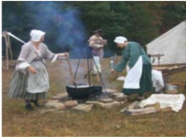
History is interpreted at pioneer camp set up for visitors and school children to enjoy.

around the region. The terror caused by guerilla warfare during the Civil War did little but isolate the region even more. Industry was limited to simple water-powered gristmills, moonshining and the mining of “nitre” (potassium nitrate) for gunpowder. You can see evidence of nitre mining in one of the rockshelters on the Twin Arches Loop Trail.