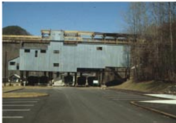
Blue Heron Tipple