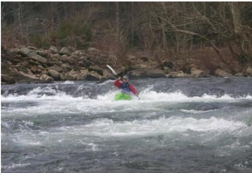
Kayaking has long been popular on the rivers and streams of Obed WSR