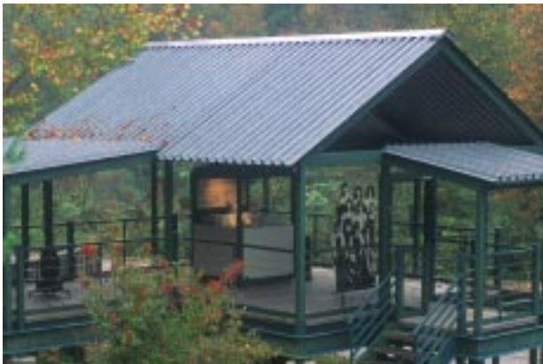
The school house, one of many "ghost structures" which are part of the Blue Heron Mining Community

It is interesting to note that most of the coal mined in Kentucky and all in Tennessee comes from the Cumberland Plateau. At present, the river has just begun to cut into the limestone deposits, which are estimated to be over 320 million years old. Limestone, therefore, plays an insignificant part in the landscape of the area. As you travel from the gorge rim to the river below, the various rock layers become evident.