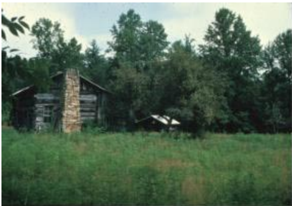
The Oscar Blevins Farm is one example of a subsistence farm. Others are the Lora Blevins Farm and the John Litton/General Slaven Farm.

These hardy pioneers thrived on the independence and isolation of the Cumberland Plateau. Through hard work and determination they established small, self-sufficient farms and eventually small communities. For the next 100 years relatively little changed on the Plateau as progress seemed to flow