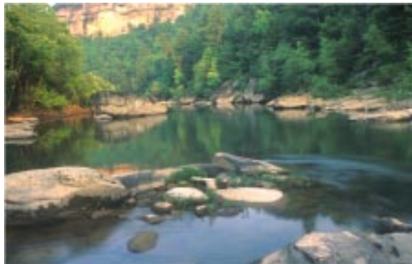
Leatherwood Ford in the evening sun

The rivers and streams have been the major force that has created the often-dramatic landscape of the area today. As the streams have cut downward into the sandstone, which caps the plateau, they have carved out gorges and canyons, leaving behind cliffs, natural arches, rock shelters and waterfalls. Elevations are not extreme, but change suddenly. They range from 1800 feet along the highest ridge tops to 800 feet along the river.