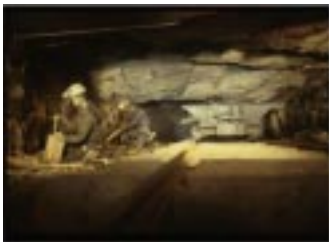
Coal mining exhibit

Hike, drive, or ride the Scenic Railway to the Blue Heron Mining Community. Pick up a copy of "A Guide to the Blue Heron Community" to assist you as you walk around the re-created mining town of Blue Heron.