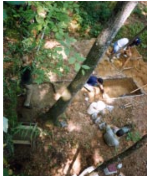
Trained archeologists under park service supervision work to recover artifacts .

Many of the dry rockshelters on the Cumberland Plateau have preserved clues about prehistoric life not found in other open sites. Unfortunately about 98% of these sites have been damaged through vandalism and the hunting of relics. Artifacts and archaeological sites are rare, non-renewable resources. You can help preserve Big South Fork's cultural history. If you find an artifact or archaeological site, leave it as you find it. Please report any recent site destruction you may observe or any artifacts or sites you may discover.