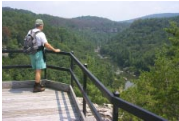
Hiker at Lilly Bluff Overlook

the Big South Fork, it is a free-flowing river and changes dramatically with the weather conditions and the seasons. The visitor center in Wartburg is the best place to plan your visit to the park. Wartburg, TN is located 34 miles south of Oneida on US 27.