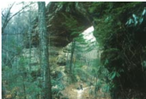
North Arch of the Twin Arches

YAHOO ARCH is another arch formed as a result of erosion at the back of a rockshelter. It can be easily reached from the Yahoo Falls Scenic Area just off KY 700.