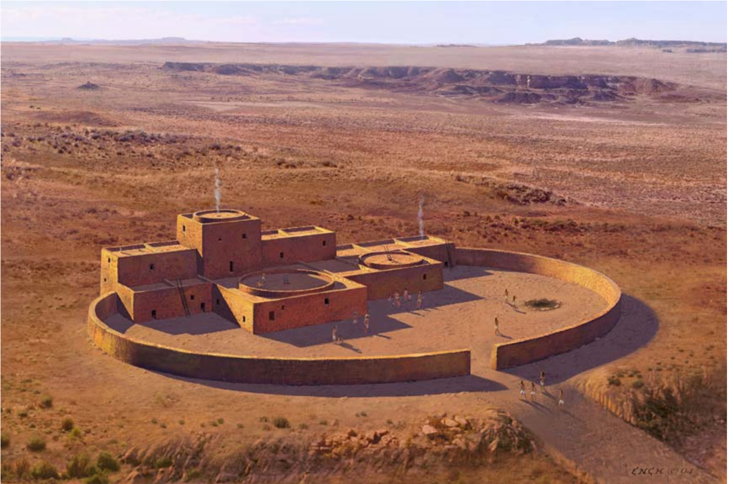
Illustration by Cory Ench of Kin Klizhin as it may have appeared in AD 1100, based upon a model by Ron Cox.

THE NAME – Tsin Lizhin or "black wood" in Navajo, possibly in reference to the charcoal or charred timbers found at the site. The name is a variant of the Navajo Tsin Nilt'iz or "hard wood," "black wood "or" charcoal place."