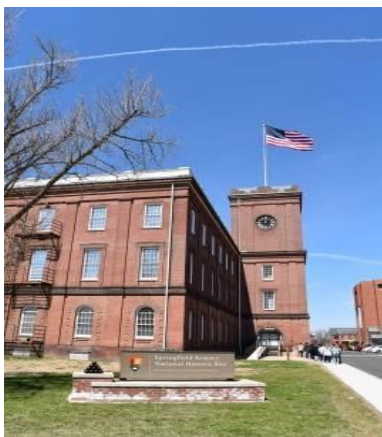
(Springfield Armory - NPS Photo)

6:30 – 8:30pm: Simply Swing Band Location: Springfield Armory NHS