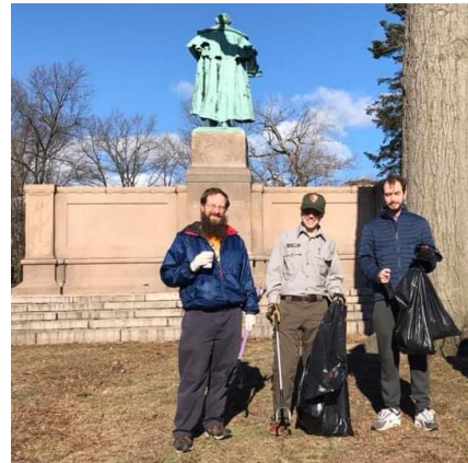
(Colt Park Clean up - Friends of Colt Park Photo)

6-8pm: Sunset Sounds Concert Series Location: Butler-McCook House and Gardens