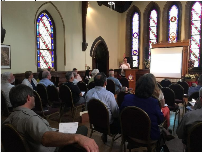
(Community Meeting -)

Last summer, the NPS worked on a combined project for multiple parks to develop some proposed architectural and engineering studies of various historic rehabilitation projects. Coltsville was among those parks chosen to work with Davis Brody Bond (DBB), the architects who designed the 9/11 Memorial in New York City, to get some preliminary potential designs for what the future Coltsville Visitors Center might look like and cost to be developed. It is important to note that these are conceptual layouts for planning purposes. The closer the park gets to establishment and actual construction many more sessions will take place to gather input.