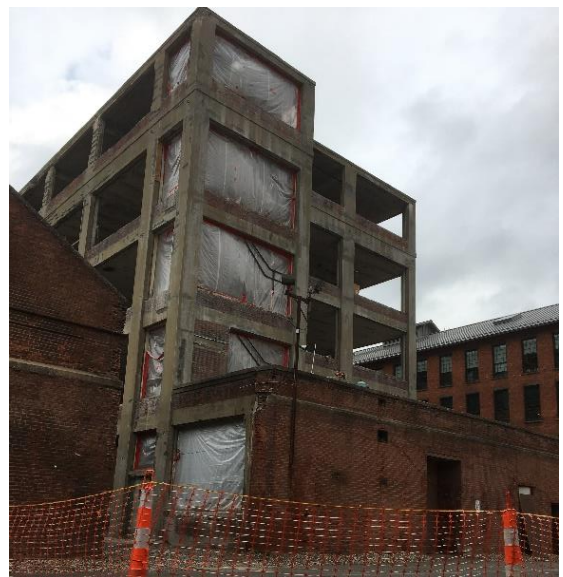
(North Armory under construction)

Colt Gateway has been working on the renovation of the complex for years and will also be the generous donor of the two 1850's era brownstones, which will be the future site of the visitor's center for Coltsville NHP.