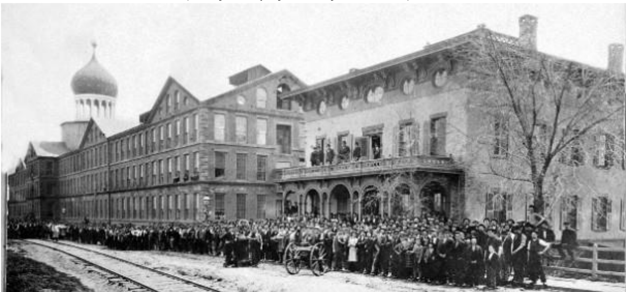
(Rebuilt Colt factory in 1876)

The cause of the fire was never established. As it occurred during the Civil War, one theory has sabotage, but there was never any evidence and mill fires were common at the time.