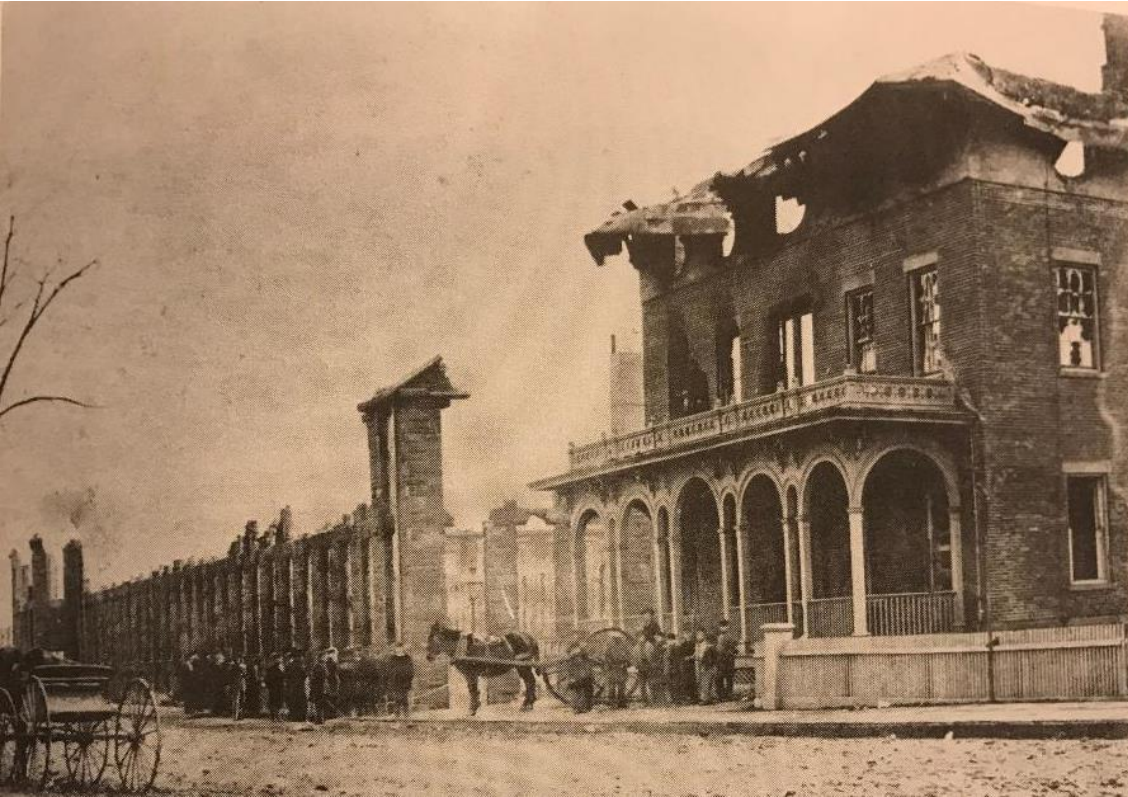
(Colt factory after the fire in 1864)

At 8:15am on the morning of Friday February 4, 1864 a fire was discovered in the attic of the East Building of the Colts Factory, near the main driving pulley for the machines. Workman tried to extinguish the fire and the fire department attempted to put it out but had problems with their water supply. The fire continued to spread, and by 9:00am the East Building was completely aflame. The widow Mrs. Colt arrived by this time and watched in horror as the Onion Dome caved into the burning building. The fire occurred during the middle of the Civil War, when the factory was running two shifts of 1500 employees. The cost of damage from the fire was estimated at $1,250,000. Samuel Colt had not believed in insurance and never insured the factory.