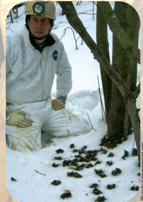
Bat Biologist discovers dead bats outside a cave in Carbondale, PA

WNS has spread from it’s epicenter (New York) to as far south as Tennessee, west to Oklahoma, and north to Canada.