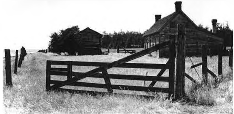
The Jacob Ebey House on the Ebey's Prairie Ridge Trail