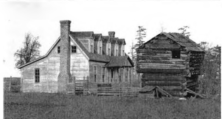
Jacob & Sarah Ebey House, and Blockhouse, ca 1900s.

That organization then transferred the structures and parts of the acreage to the National Park Service—for the perpetual enjoyment and benefit of the American People.