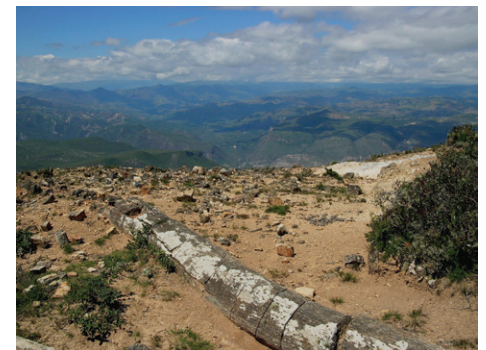
A petrified log near Sexi, Peru

Florissant Fossil Beds National Monument supports national and international efforts to conserve geologic heritage. The paleontology program and Friends group for the monument have partnered with El Bosque Petrificado Piedra Chamana (The Petrified Forest Piedra Chamana) in the Andes Mountains near Sexi, Peru, to help this “sister park” protect and educate about its fossils. Like Florissant, Sexi captures a snapshot of the Eocene, tens of millions of years ago, when the climate was more tropical than it is today. Florissant promotes sustainable geotourism at Sexi and in Colorado. The monument is the first stop on the Gold Belt Tour National Scenic Byway, a route through geologic sites with cultural and scenic value.