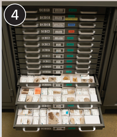
4 Fossils are organized in drawers by their geologic context. The museum will keep these specimens permanently, so that researchers can make new discoveries from Florissant fossils and check the quality of earlier scientific work on them.