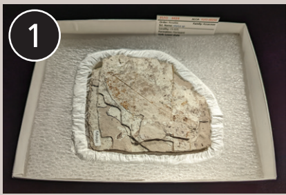
1 Fossils are nested in a small box with foam and Tyvek®.