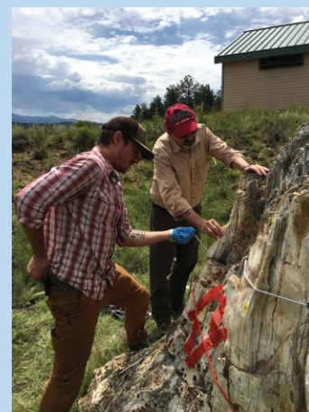
UPenn students conducting experiments on the stump just outside of the visitor center in 2019.

Paleontology staff regularly monitors the stumps. These fossils were shattered when they were historically excavated with dynamite. The monument has worked to stabilize the stumps with metal bands and overhead shelters. New projects are ongoing with the University of Pennsylvania to test stone conservation techniques on the most fragile stumps and develop designs for better shelters.