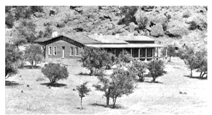
The hospital as it looked in the late 1870s. Another ward was added in 1884.

The exterior of the post hospital at Fort Davis was restored in the late 1960s. Restoration consisted of repairing the adobe walls and putting a new