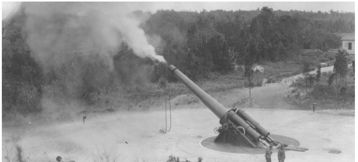
Battery Kingman firing, 1919.

Battery Potter proved too costly to build, and took too long to fire its guns. To reduce costs and improve the efficiency of the disappearing gun concept, counterbalanced gun carriages were developed during the early 1890s. This simple design greatly reduced manufacturing and maintenance costs while increasing a gun's rate of fire. A large counterweight, connected to two pair of steel arms holding a large gun barrel, dropped down and quickly raised the gun up from behind a protective concrete wall. When the gun came up over the wall it was fired. Firing made the gun recoil (kick back) behind the wall and back into its loading position. A well-trained gun crew could fire two rounds a minute from a 10- or 12-inch counterweight mounted gun. From 1896 to 1909, seven counterweight-type disappearing gun batteries, mounting a total of sixteen 6-, 8-, 10-, and 12- inch caliber guns were built at Sandy Hook. These included Battery Granger, and the Nine-gun Battery at North Beach.