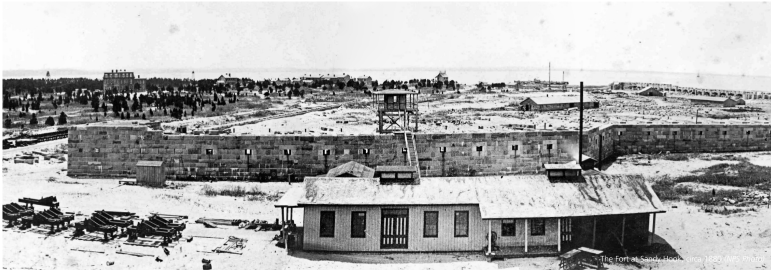
The Fort at Sandy Hook, circa 1880

Sandy Hook's location at the entrance to New York Harbor made it an important site for the defense of New York City. Large enemy warships had to navigate the Sandy Hook Channel to attack the harbor, putting them within cannon range of Sandy Hook. The series of forts built on Sandy Hook from Colonial days to the modern missile era represented the latest defensive systems. Each fort used the newest technological improvements in weapons and construction techniques in their time.