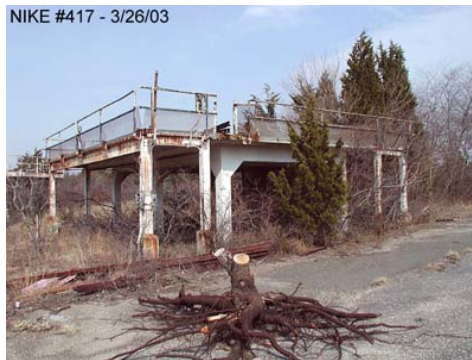
Target Tracking Radar Tower as photographed in 2003.

PD: Alright, the generators have been taken away. The generators are missing. We are moving east and north of 414 toward two, the remains of two concrete based radar towers. The first one we are looking at is 417.