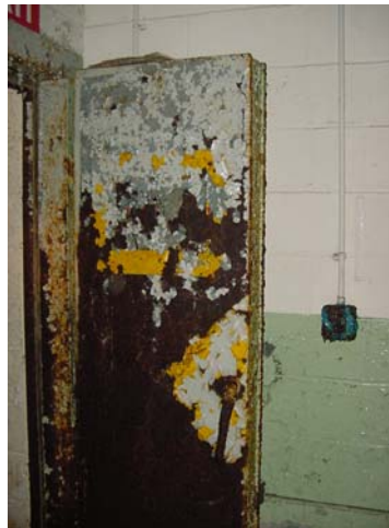
Blast door photographed in 2003.

TH: The closet right behind this blast door.