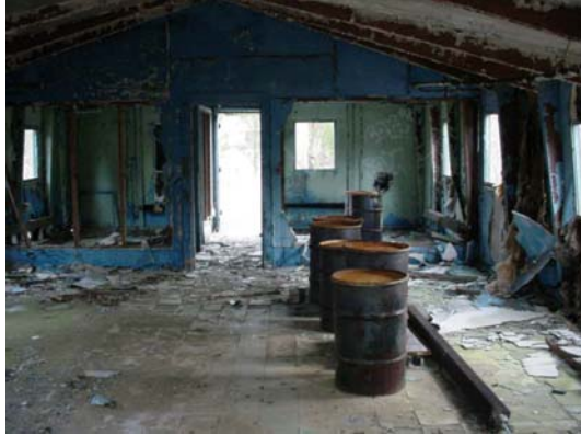
Interior of Alert Barracks 403 photographed in 2003.

TH: That's right. We have it listed once again as an Alert Barracks and you walked in right here stenciled to the right of the front door, the words "Support Contact Team."