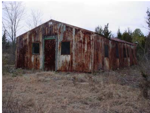
Alert Barracks 402 photographed in 2004.

PD: There appear to be some dark oil stains between the two sides, the two pieces of this truck loading ramp. It is probably a place for car reparations and changing oil in vehicles. There is no number for this truck loading ramp. We are now looking at a small concrete pad that is located between the truck loading ramp and Building T-402. It's just a concrete pad with four bolts sticking out. They are both rusty and an iron pipe. We will have to identify this later. We are now standing in front of 402. It is padlocked. There seems to be a glass grated covering over each window. What do you think this was once used for, Tom?