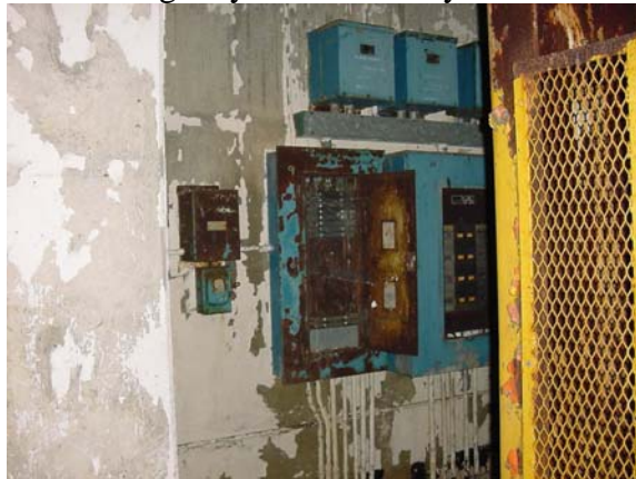
Electrical panel next to elevator as photographed in 2003.

RM: Right here is the panel for the elevator. You had the elevator operator over in this part. Right here would be the safe. There used to be a safe that would have arming devices for the missiles, okay because the missiles weren't armed. They used to have a pin. A little round pin, they had different pins that would fit in symmetrically into the warhead itself and the section chief would check it and there would be one man arming it. The section chief would be right behind him. Meanwhile, they had the elevator which was run off 440 power. So, they used to pull 440. Later, they converted it but I, the Missile Site, it was the 440. This is pretty self explanatory, okay. They had it would be in a locked position and this was the water hose. The ceiling lights, the power lights, the main lights okay. 416, it used to be 440. There is the 440 right there. And you can see the size of the cables we basically dealt with. They were large cables with the head that were a pin index right in there. Basically in the dark so if someone was coming down here and they had a flashlight and were just looking this would be basically about where the missile would stop. It would give you an idea so you wouldn't walk into it.