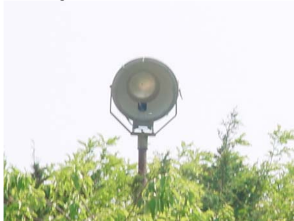
Flood light inside the Launching Area as photographed in 2003.

RM: Two fold purpose. In case it was ever done at night and besides being at night if there was ever an infiltrator they could turn the lights on them and they could find them pretty easy. You notice this is done on the inside. It is mostly for transporting. They wanted to make sure it was safe because say they put it in and all of a sudden a complication had happened, right, they may still want to work on it. You really couldn't leave it in here overnight not without keeping guards on constantly and that will drive a guard up the wall being out here in the cold so you might work on them when you need to pull it out there to keep the lights on. Just as there are lights up in the other section. Now they did have war games also. We played war games here. There would be evaluator would come here and use that as a headquarters or so and we used to play war games like, "Bang. You are dead." A guy would come in and give you a note, Bang you are dead. Things like that. You know the war games were the interesting portion. It was pretty fun.