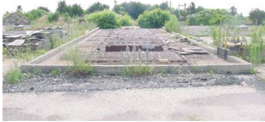
Charlie Section, 426, elevator as photographed in 2003.