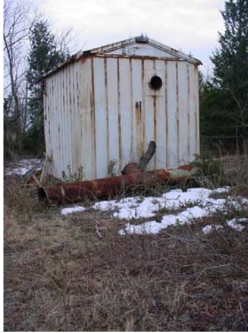
Boiler Room 407 as photographed in 2003.

they have been done by jokers. Now just west of 406 there is another building. It's number is T-407. What was this, Tom?