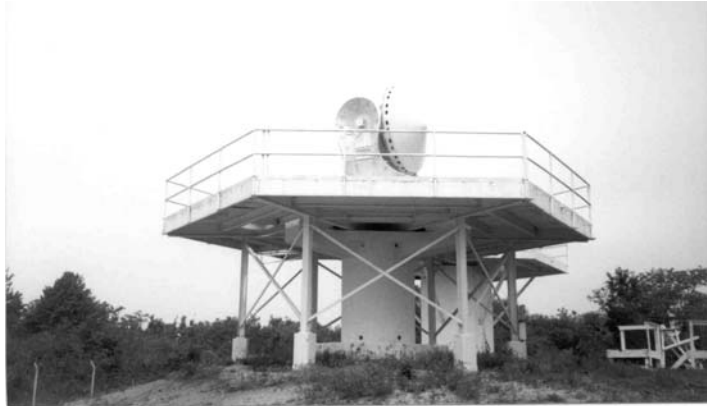
Target tracking Radar Tower in 2003.

PD: We are now at 472 and this looks like another tower. What does that read?