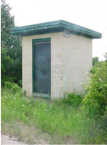
Building 447 as photographed in 2003.

S-447 was basically oil and paint, well mostly grease, okay. There was another paint shack. I don't think it is right here right now. It was destroyed. It was right on the outside.