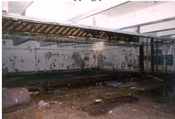
View of the area below the elevators where the Nike Missiles were once stored. Photographed in 2003.