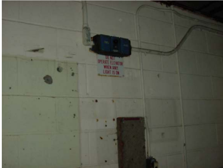
Inside Alpha Section.

Sign states "Do Not Operate Elevator When Light is On." Photographed in 2003.