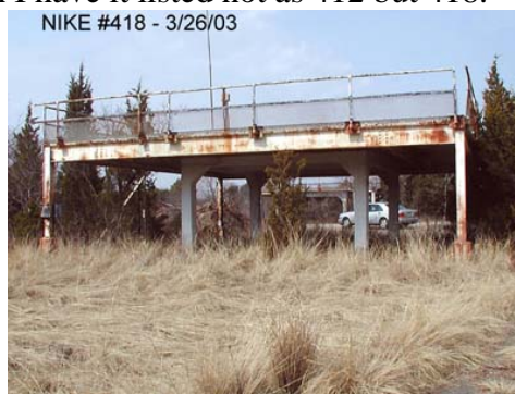
Acquisition Radar Tower photographed in 2003.

PD: According to my plan I have it listed not as 412 but 418.