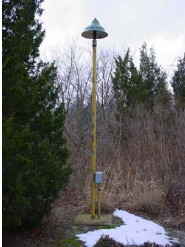
Light pole photographed in 2003.

TH: As an after thought looking at the light stanchions they seem to date from about the same time as the buildings went up here at the radar site which is probably around the late '50s or the lights might have been put in during the 1960s.