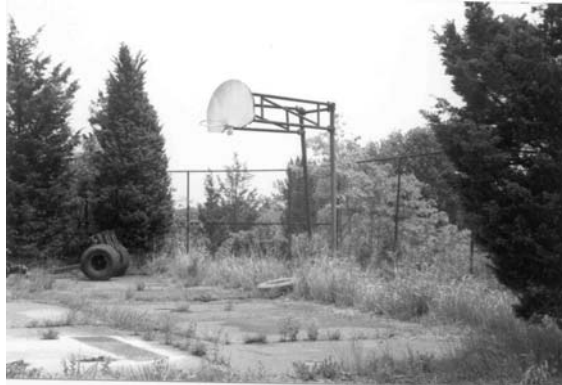
Basketball court as photographed in 2003.

PD: These trailers are stored in a semi surrounded asphalt pad compound that used to be an old basketball court, an open air basketball court. (Information not important.) You can still see the lines for basketball and badminton they used play on this asphalt court. There is even a rusty old basketball net up there, backboard.