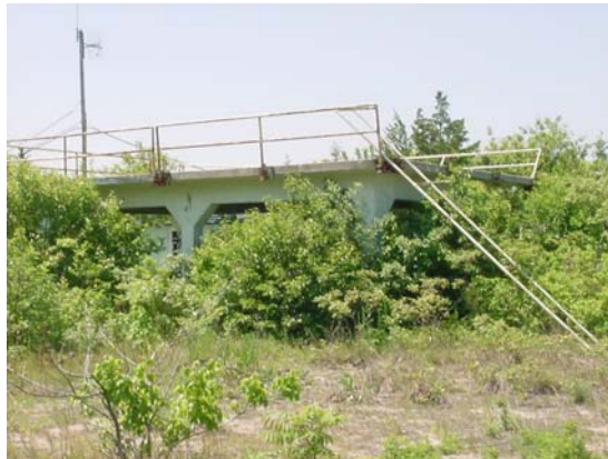
Photo from 2003 of 420, Target Tracking Radar Tower.