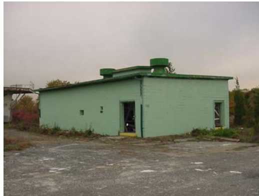
HIPAR Building 468. Photograph from 2003.

TH: 468 is the HIPAR Building. HIPAR radar, the way I understand it was the long range radar that would sweep out over the ocean to make the initial contact with anything flying out there.