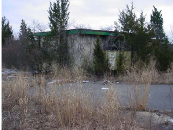
Building 454 as photographed in 2003.