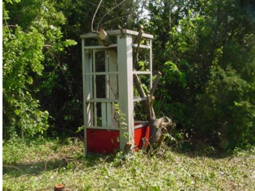
Telephone booth photographed in 2004.

PD: Between 403 and 404 we have the remains of an aluminum telephone booth. All the windows have been smashed out of it. You might write that down on our map just right here. We note that in the telephone booth the telephone says to deposit 10 cents. That might be datable by that information. We are now walking east of 403.