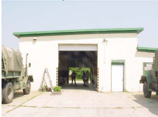
Missile Assembly Building S-449 photographed in 2003.

PD: We are standing in front of building S-449. What was this used to for?