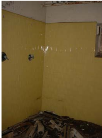
Inside shower area of Latrine 406 as photographed in 2003.

PD: Alright we are now standing in front of Building T-406.