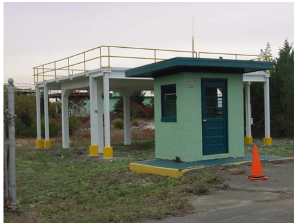
Sentry Box (423) with Missile Tracking Radar Tower (422) in Background in 2003.

PD: And we are standing right here just on the south side of (Building) 423 and that was a Guardhouse.