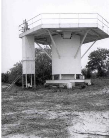
Target Ranging Radar Tower 467 photographed in 2003.