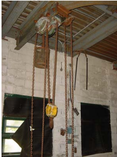
Hoist system inside the Warhead Building S-450 photographed in 2003.

PD: We are now looking at Building S-450 and we are on the west berm surrounding that.