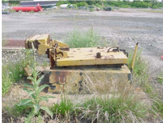
Main Hatch to Alpha Section also know as number 428. Photographed in 2003.

hours on, 24 hours off. 8 hours (on) and 8 hours (off). On your 24 hours on, after you got a few hours sleep you would be here at 5:30, 6:00 in the morning and you had to do daily checks on the missiles to insure the safety of them. And your first thing you would start with would be on this block over here. On this block over here there would be a generator and there would be safety check.