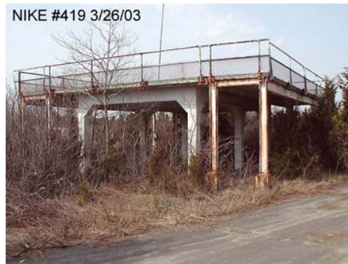
Missile Tracking Radar Tower photographed in 2003.