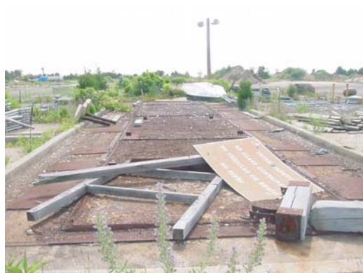
Elevator at Bravo Section, 427, as photographed in 2003.