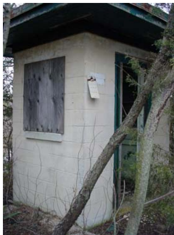
Sentry Box 413 photographed in 2003.

TH: That is Building 413, another Sentry Box right there.