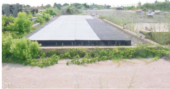
Elevator opening of Alpha Section, 428, photographed in 2003.