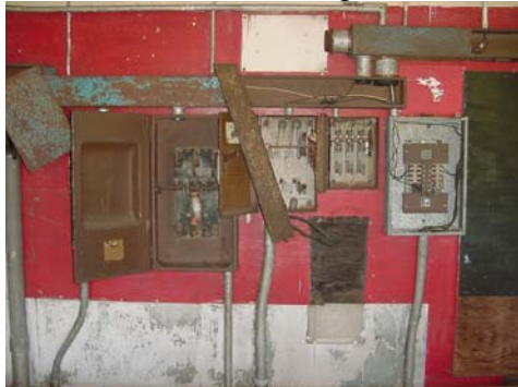
Inside the Generator House 414 as photographed in 2003.

TH: 414 on the master list is a Generator House again.