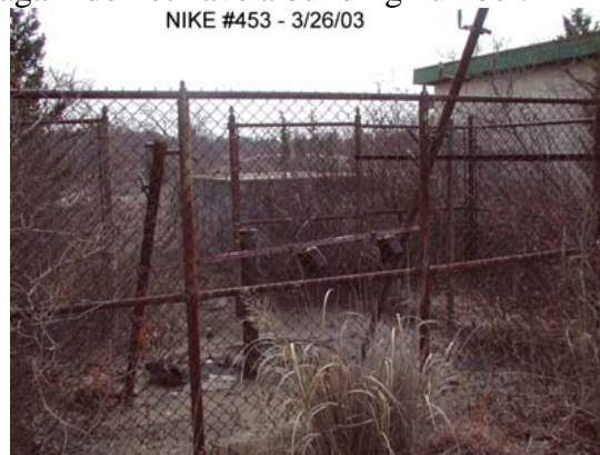
Transformers next to Building 453.

TH: It had something to do with the transformers. That concrete block structure is 453. The transformers once again do not have a building number.