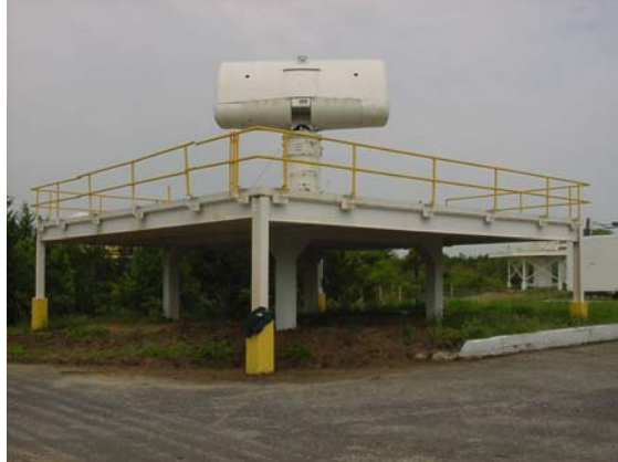
Structure 421, Acquisition Radar Tower in 2003.