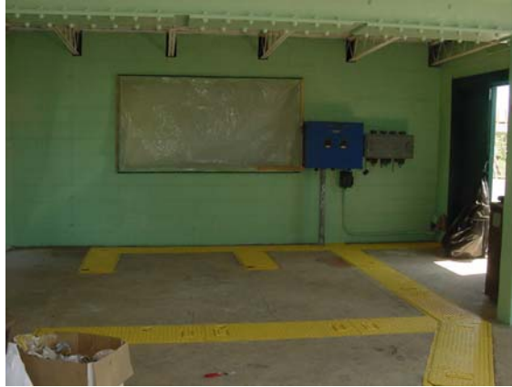
Interior of Generator House 410 during cleanup in 2003.

TH: 410 is listed as the Generator House.