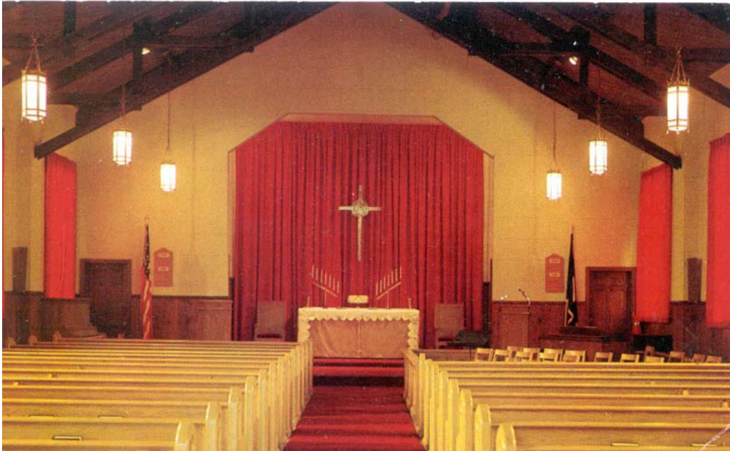
Postcard of Fort Hancock Chapel from 1960s.