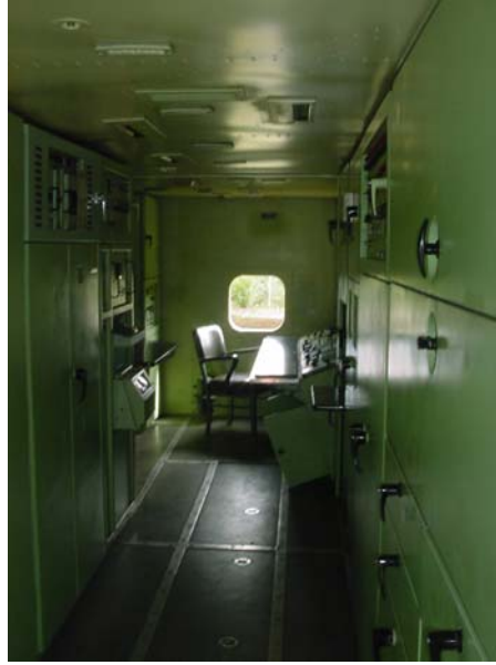
Inside the van in 2003.