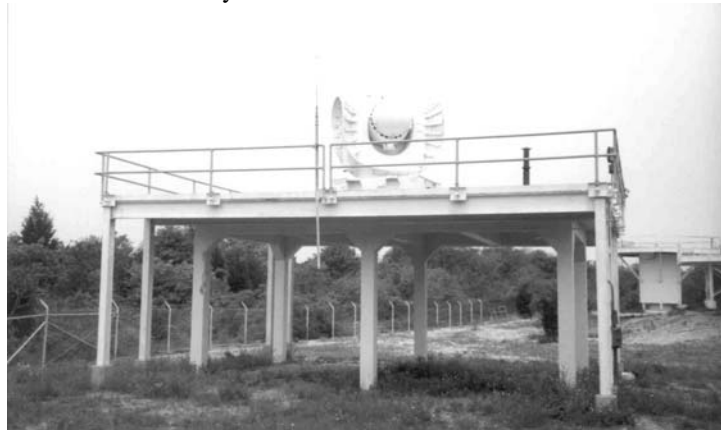
422 Missile Tracking Radar Tower. Photo taken in 2003.

RH: On that tower was the Missile Tracking Radar. And the purpose of the Missile Tracking Radar was to track, of course, the missile. And the Hercules system only had the capability of firing one missile at a time. Take it all the way down range and get it close to the target. At that time, by computer order and radar order, it would burst the warhead and destroy the target. And I guess their kill rate with the Hercules Missile was somewhere around 95 or 96 % effective at the maximum range. I see you got there original in relation to other buildings. Okay, the Missile Tracking Radar was well located within, it had to be within 250 feet of the Radar Control Van. The maximum cable length was 252 feet. I think at this site here, the cables were just about at its maximum length so I would say from the RC Van it ran approximately 250 feet. Now the Missile Tracking Radar minimum range to the Launching Area was a mile. Maximum range could be up to six miles. And the reason for the minimum range of a mile was that when the missile was fired it was so fast that it would exceed the tracking rate of the radar if it was any