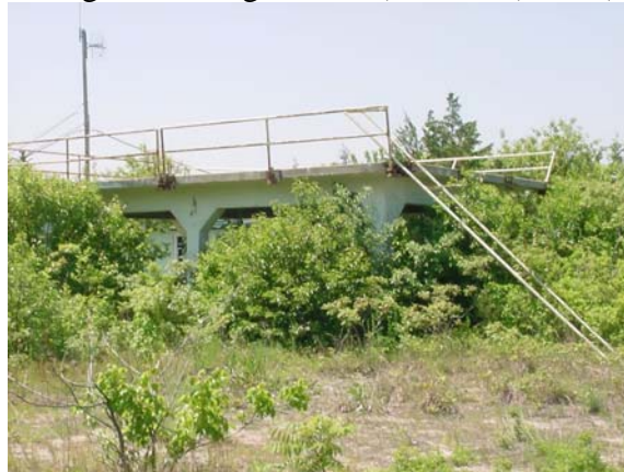
420, Target Tracking Tower. Photo taken in 2003.

PD: Then what was the Target Tracking Radar? (Structure) 420 (1956)?