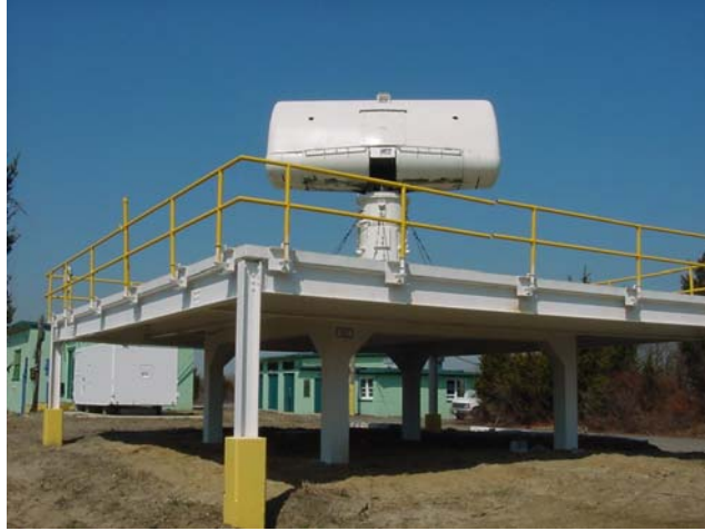
421, Acquisition Radar Tower. Photo taken in 2003.

RH: 421 (1956) would be where the Acquisition Radar sat.