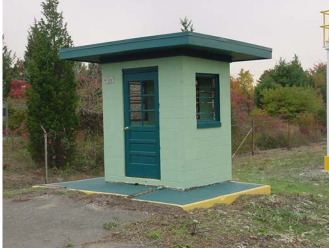
Sentry Box 423. Photo taken in 2003.