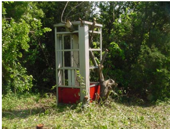
Telephone booth in 2004.

PD: Tell us about the telephone booth there. It's still there.