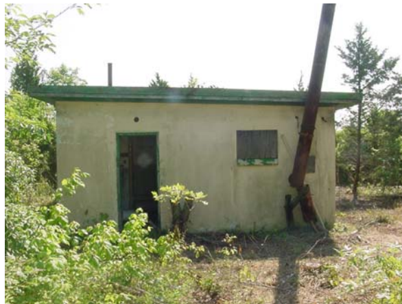
406 Latrines. Photo taken in 2004.