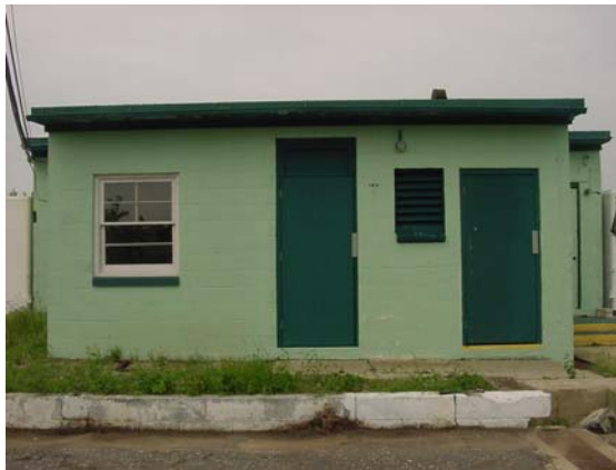
Building 409 Inter-connecting Corridor Building. Photo taken in 2003.

PD: Getting into buildings now, next to these three tracking radar, radar towers, there is Building 409 and 410. 409 (1956) is called a Connecting Corridor.