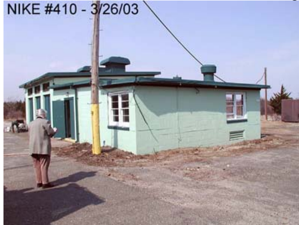
Building 410, Generator Building. Photo taken in 2003.

PD: Then what was 410 (1962)? It was called a Generator Building.