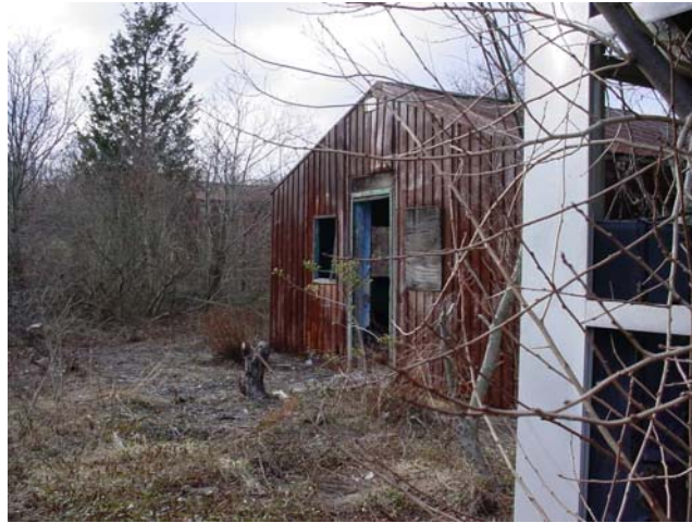
Barracks 403 taken from telephone booth in 2004.

PD: Alright so if 402 was for equipment and office. 403 to 405 was just barracks?