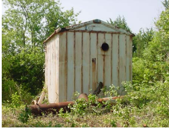
407 Boiler Room. Photo taken in 2004.

PD: Were those barracks comfortable especially during the winter down here or were they..?