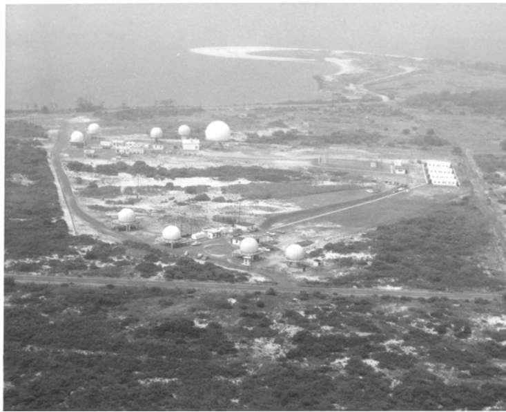
U.S. Army photo of Fort Hancock's Nike Radar site, called the Integrated Fire Control Area. c. 1970.