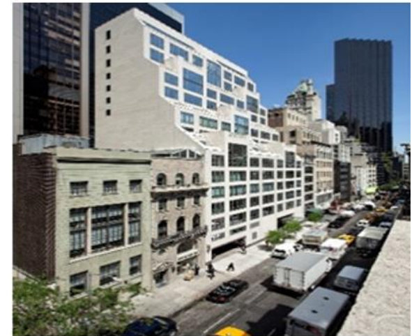
The Centurion, New York Condominium Development 47 Residential Homes Pei Partnership Architects with I.M. Pei