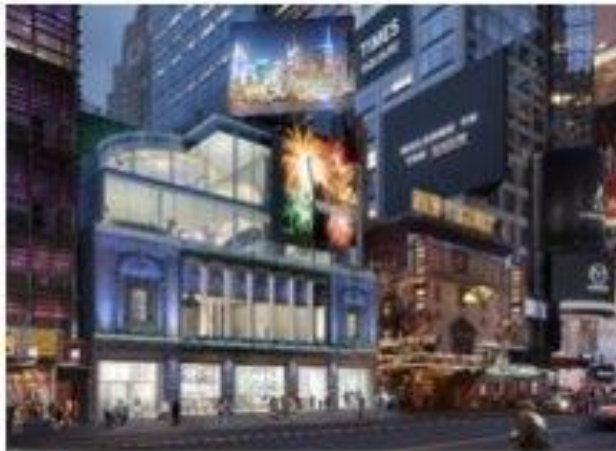
Times Square Theater (historic) New York Retail Conversion 55,000 sf Beyer Blinder Belle Architects NYC EDC Master Lessor