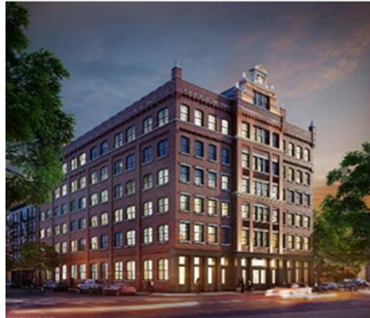
The Schumacher (historic) , New York Condominium Conversion 20 Residential Homes Morris Adjmi Architects