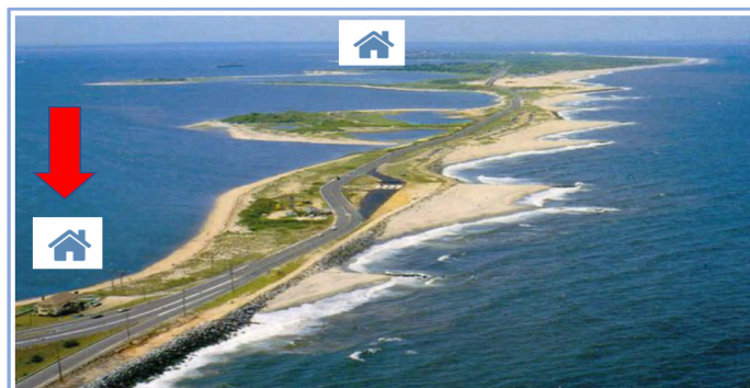
SH 600 (aka Sandlass House )