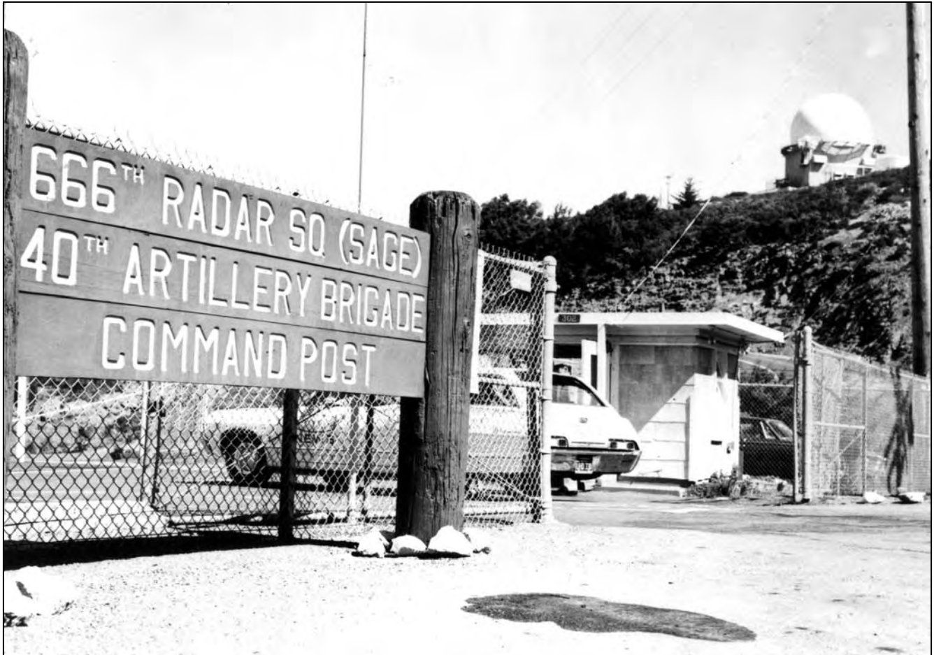
The entrance to the Mill Valley Air Force Station on Mt. Tamalpais, clearly indicates that the facility was shared by the Air Force's Radar Squadron and the Army's Air Defense Command Post.