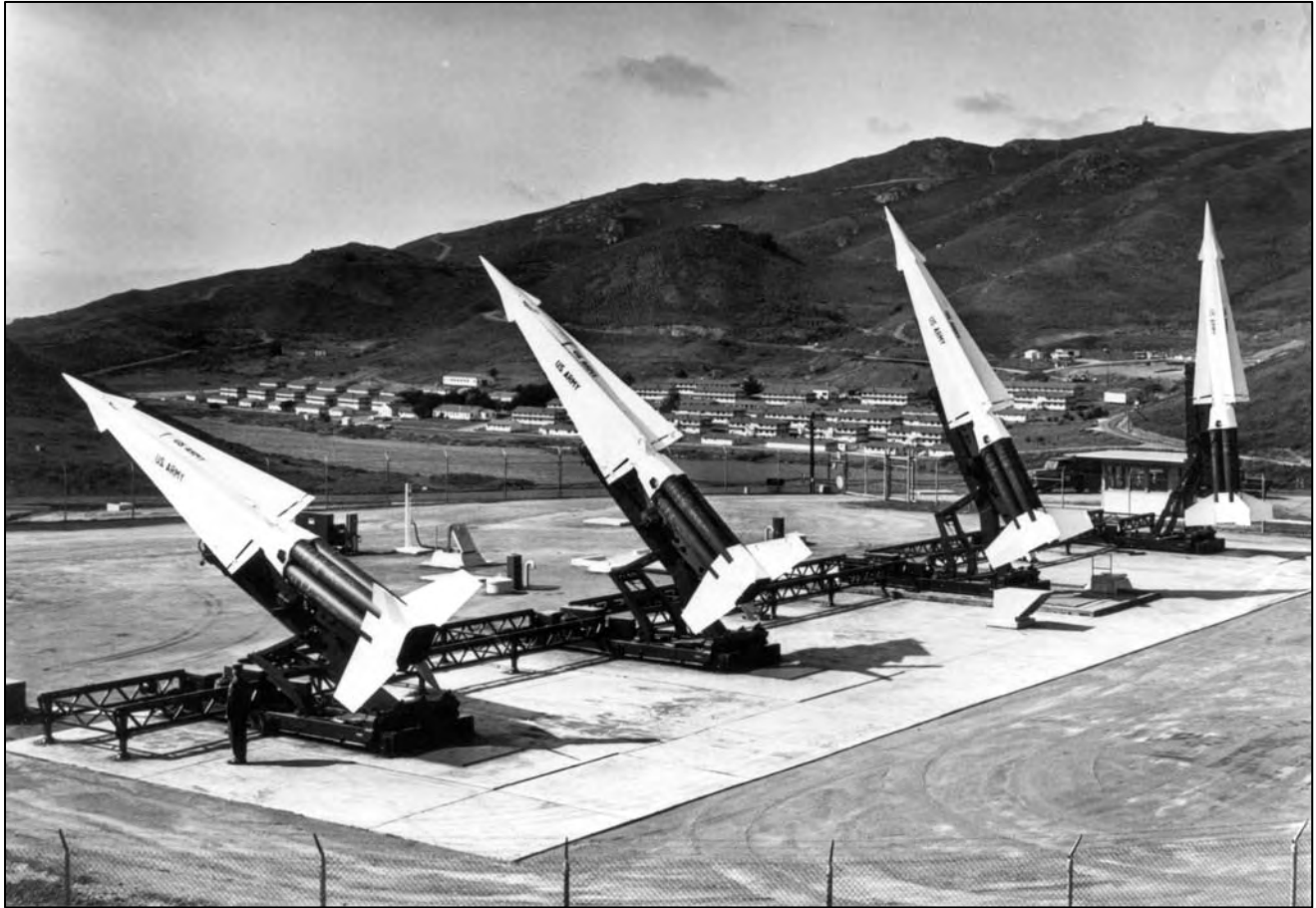
“A” Section at SF-88L, circa 1959. The four Nike Hercules missiles are arrayed for the photographer’s benefit, in a non-launching configuration. The cantonment of Fort Cronkhite is visible across the lagoon. This famous view of SF-88L was used time and time again to illustrate the Nike missile defenses of the Bay Area.