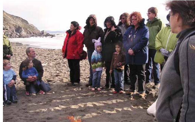
Left, Top & Bottom images: Traditional prayer led by a representative of the Coast Miwok at the annual Welcome Back Salmon ceremony at Muir Beach.