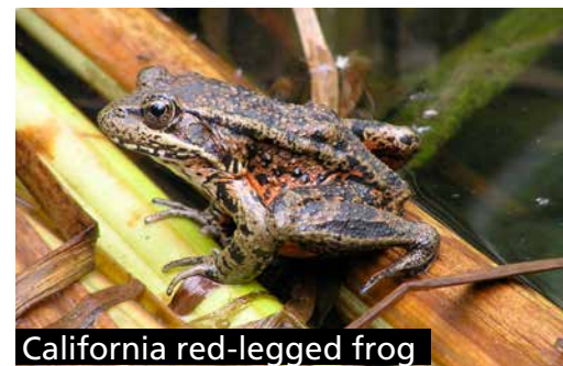
California red-legged frog

The watershed is home to several of the West Coast's most imperiled species, among them, coho salmon, steelhead trout, and the California red-legged frog. Habitat restoration has helped its red-legged frog population, but coho salmon are still in a highly precarious position. When salmon return to their native spawning grounds in upper Redwood Creek, they bring deep-ocean nutrients to the redwood forest. Without the salmon, a key piece of the age-old cycle of the redwood forest is gone and an important connection is lost.