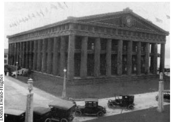
The Oregon Exhibit Hall.

Many of the cultural perspectives presented by the nations, states, and corporations that exhibited at the fair would be seen today as insensitive to indigenous peoples and women. This was not surprising: the fair was a celebration of the prevailing notions of the day, not an examination of them.