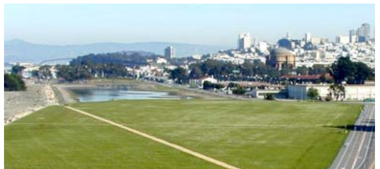
The site of the fair today.