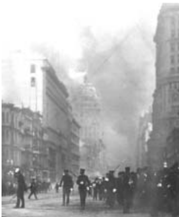
San Francisco 1906.

In 1903 President Theodore Roosevelt announced that the U.S. would complete a canal across the Isthmus of Panama, begun years earlier by a French company. The canal would cut 8,000 miles off the distance ships had to travel from the east coast to the west. No canal of this scale had been built before, and many said it could not be done. The geopolitical effects of the canal on the ascendancy of the United States on the world stage were profound.