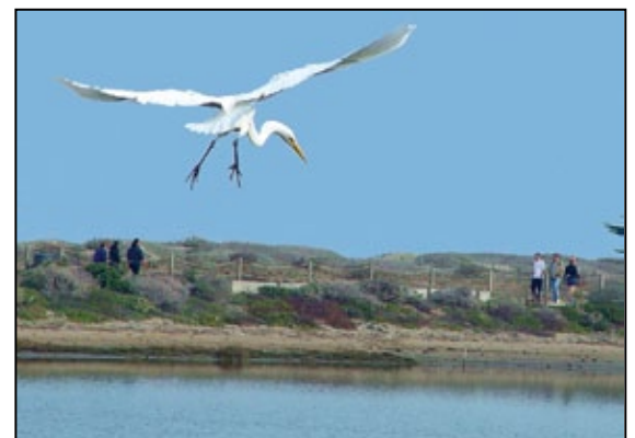
The Presidio provides sanctuary to both nature and urban dwellers.

The wildlife and native plant communities at home in the Presidio today are testament to the resilience of the natural world—evidence that there is a place for nature in cities. Wildflowers bloom almost year-round. Oak woodlands, where Ohlone peoples collected acorns, continue to bear fruit each fall. To experience the Presidio's living natural history yourself, take a stroll through moody, fog-drenched woodlands, careful not to step on banana slugs hiding in the leaf litter. Or walk barefoot on Baker Beach and feel the sand shift beneath you. A red-tailed hawk soars above as a lizard darts away from your approach. In these moments it is not difficult to imagine the Presidio as it once was.