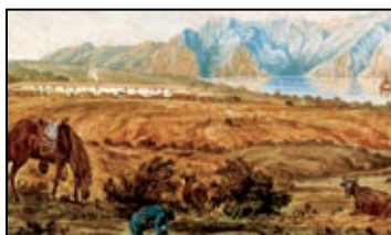
Spanish and Mexican era grazing and farming transformed the natural Presidio. Painting by Beechey, 1826