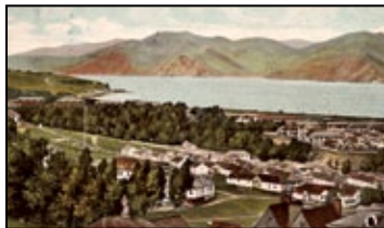
By the early 1900s buildings and forest began to blanket the Presidio.

The natural history of the Presidio is a story both of change and constancy.