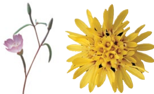
Presidio clarkia (left) lives only on serpentine soils and San Francisco lessingia (right) requires dunes.

to the surface along faults. Though serpentine soils are poor in nutrients and high in toxic metals, the endangered Presidio clarkia and Raven's manzanita, among others, have adapted and thrive. Sand dunes that are dry, nutrient poor, and ever-shifting with the wind are home to rare species such as the San Francisco lessingia and dune gilia that have adapted to survive in these conditions.