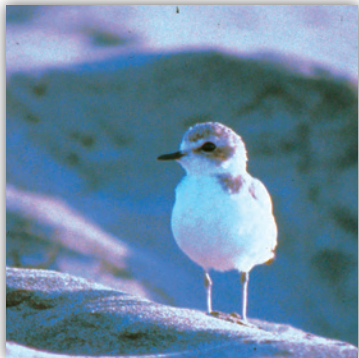
Western Snowy Plover resting on Ocean Beach.

In March 1993, the Western Snowy Plover ( Charadrius alexandrinus nivosus ) was listed as a threatened species, protected under the Endangered Species Act. Up to 100 of the estimated 2,300 birds remaining on the Pacific Coast can be found in Golden Gate National Recreation Area (GGNRA).