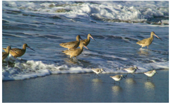
Top: Western Snowy Plover feeding at the high tide line. Bottom: Shorebirds feeding at the water's edge.