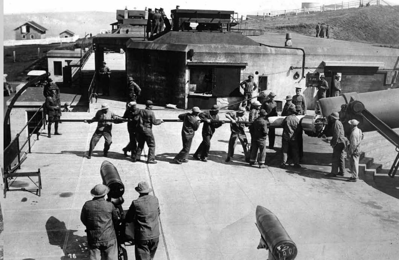
Above: Target practice at Battery Mendell. The soldiers in the center are loading a powder bag into the breach of the gun in the "down" position. Note that it required six men to push the ramrod to load the gun. In the foreground at left, two men are waiting with a "shot cart" that held the next shell to be loaded. Notice the Point Bonita Lighthouse keepers' residences behind the white fence at the back left. (Photo circa 1920)

Battery Mendell was outfitted with the army's modern innovation: a pair of 12-inch guns on "disappearing carriages." When the guns were ready to fire, they would rise into position, fire a single shot and then recoil down and out of sight for reloading; ing guns and the soldiers were hidden from enemy view behind a huge concrete parapet camouflaged into the surroundings.