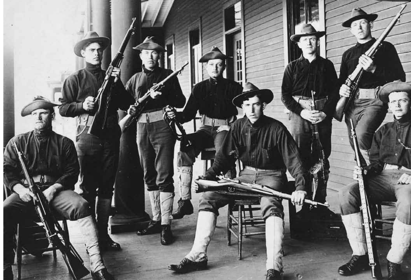
Above: Fort Barry soldiers proudly showing off their state-of-the-art, Model 1903 Springfield rifles. Notice that the soldier fourth from the left is holding a bugle. The army used bugle calls for marking the events of the day and company buglers frequently entered into friendly competitions (Photo circa 1908).

Fort Barry's wood-frame, three-story barrack buildings represented an improvement in military housing. Prior to the Endicott-period upgrades, living conditions in the U.S. Army were dismal; most buildings were poorly constructed, cramped and unsanitary. However, by the early 1900s, in order to stem the flow of deserters and encourage recruitment, the army began to design larger barracks with a new emphasis on proper ventilation, clean running water and modern toilet facilities. The Fort Barry