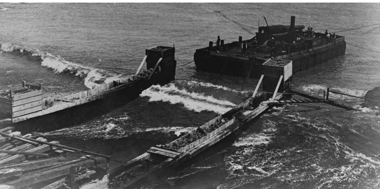
Above: The arrival of a seacoast defense gun. The U.S. Army Corps of Engineers used a specially-designed barge for transporting the big guns, carriages and heavy material to the wharf at Bonita Cove. (Photo circa 1902)