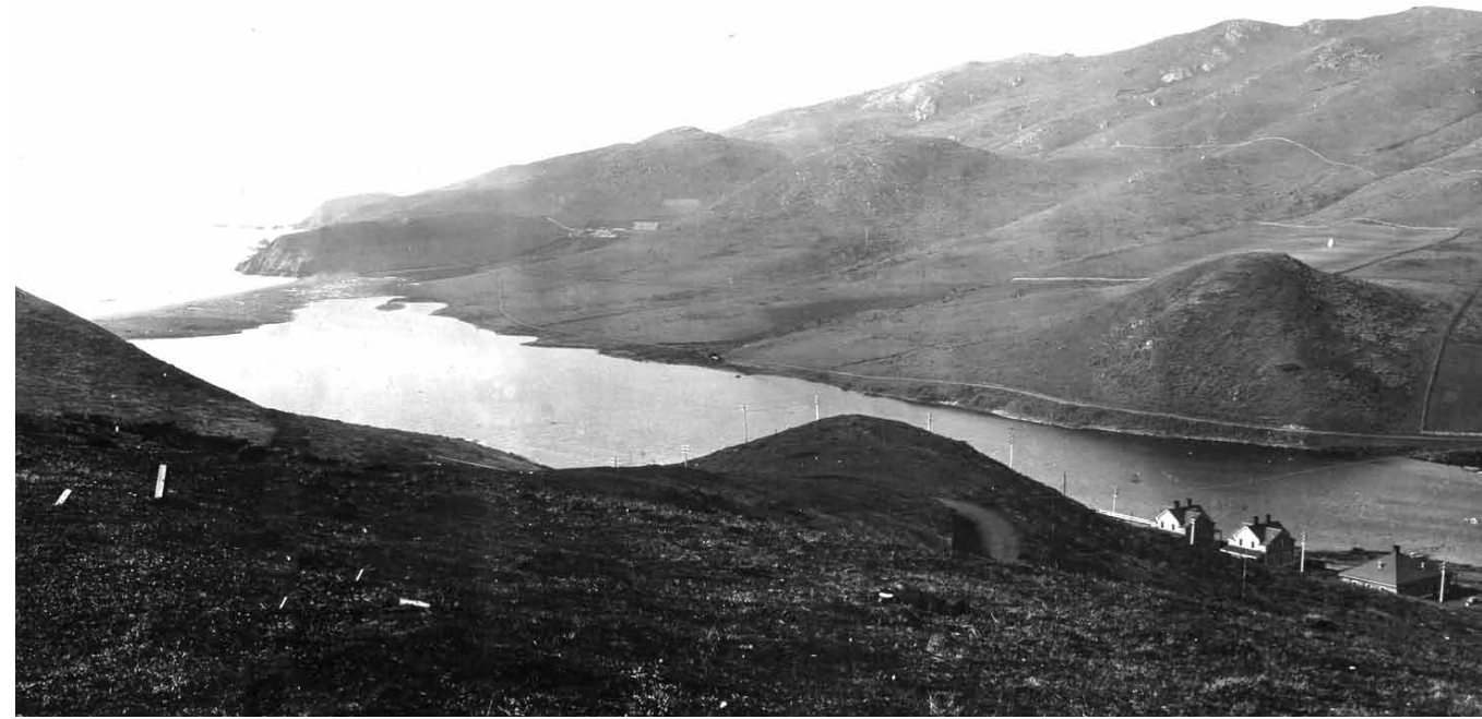
Rodeo Lagoon in 1913. Even after the army established Fort Barry, the Marin Headlands was still a very rural and open landscape. To the right are two Fort Barry army residences and the post guard house (no longer extant); across the lagoon, a dairy farm is nestled in the valley where Fort Cronkhite is now located. (Photo circa 1913)

From the Marin Headlands Visitor Center, carefully walk from the parking lot, crossing Field Road onto Bodsworth Street, and proceed up the hill. Turn left onto Simmonds Road and continue straight towards the buildings, following the signs to the Headlands Center for the Arts and the Marin Headlands Hostel. You can also pick up the Coastal Trail here that leads you to the historic rifle range (see Stop # 6) and the Golden Gate Bridge.