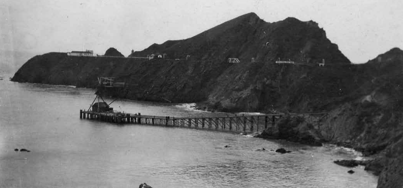
Above: A view of the engineers' wharf and trestle down at Bonita Cove, as well as the tunnels and walkways leading to the Point Bonita Lighthouse in the background. (Photo circa 1915)