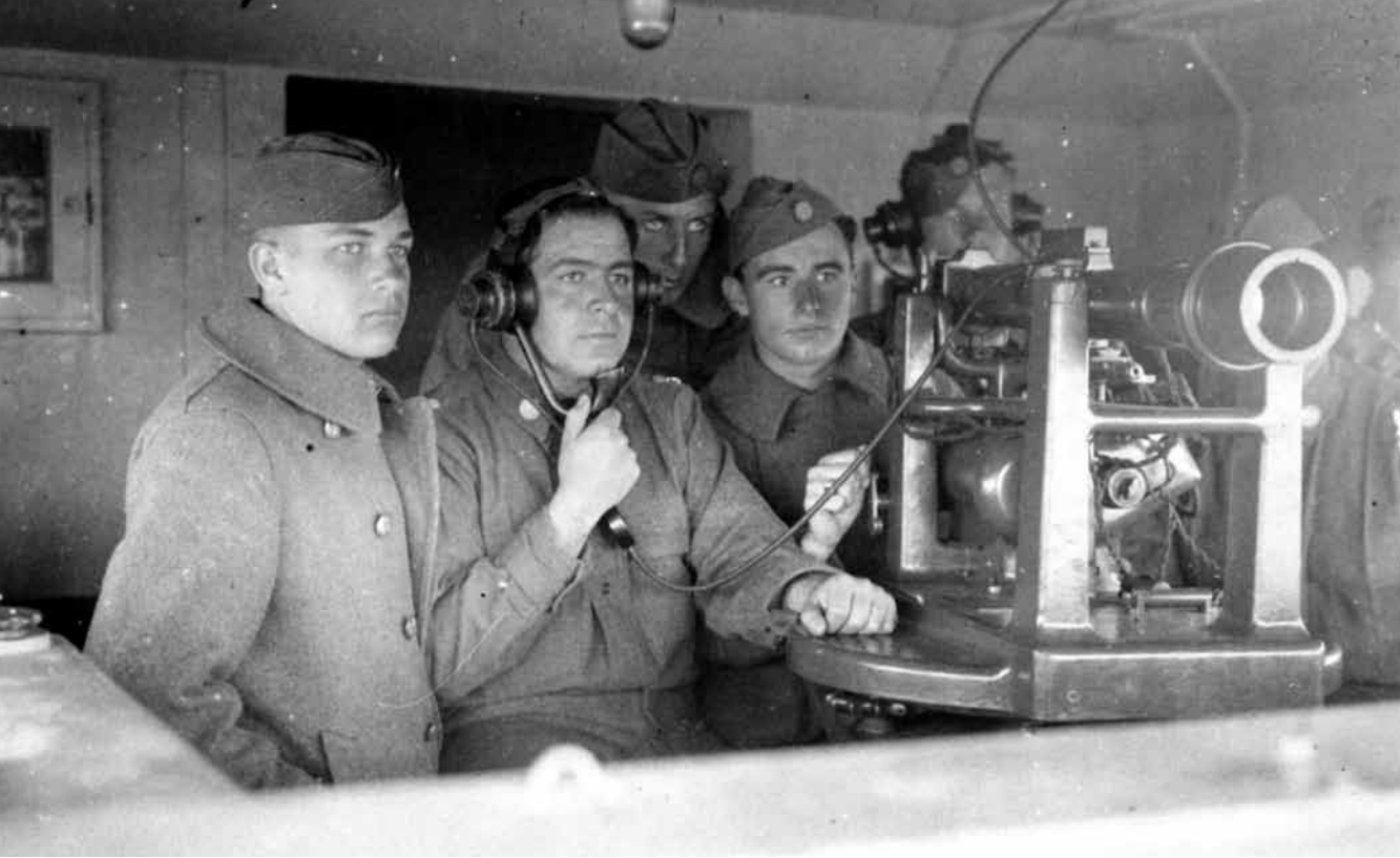
Above: The range finding crew in the Battery Commander's station at Battery Smith-Guthrie, 1920. The large telescope is a "Depression Position Finder" used for determining the range to the target. The soldiers with the headphones are talking to the off-site plotting room and gun crews. (Photo circa 1920; courtesy of the California Military Museum)