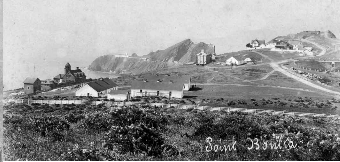
Above: Point Bonita Reservation around 1915. During this time, there were many activities at the Reservation. There was the Lifesaving Service station (far left); the U. S Army Corps of Engineers' bunk houses and mess hall (left); the concrete plant (middle); the army stables (right middle) and the lighthouse keepers' residences (right). The Point Bonita Lighthouse (in the distant left center), constructed in 1855, was the third lighthouse on the West Coast.