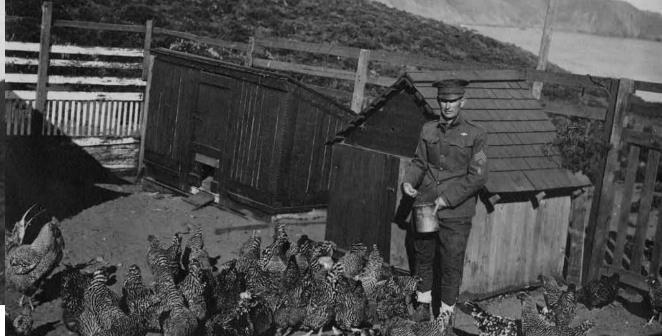
Above: A Fort Barry soldier feeding chickens. The Engineering Camp at Point Bonita Reservation was very isolated; in order to obtain fresh food supplies, the soldiers had to brave the winding, treacherous drive to Sausalito. Soldiers managed a flock of chickens to ensure a steady supply of fresh eggs for the military families. (Photo circa 1910)

Bonita Cove supported by a 250-foot trestle topped with a railroad track that led from the wharf to the top of the cliff. A powerful hoisting apparatus transferred the heavy goods from the top of the tramway to waiting horses and buggies.