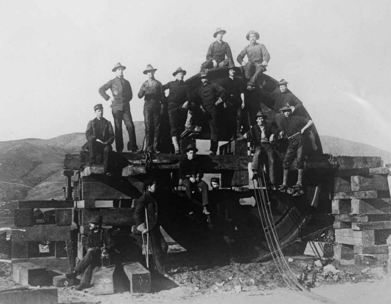
Above: Fort Barry soldiers during the construction of Battery Mendell. The men are posing with a large metal base ring, used with a 12" mortar, prior to its installation. Notice the cables and large lumber required to keep the piece in place. (Photo circa 1903)

Endicott-period batteries did not provide any covering or overhead protection for the guns because aerial attack wasn't yet considered a threat.