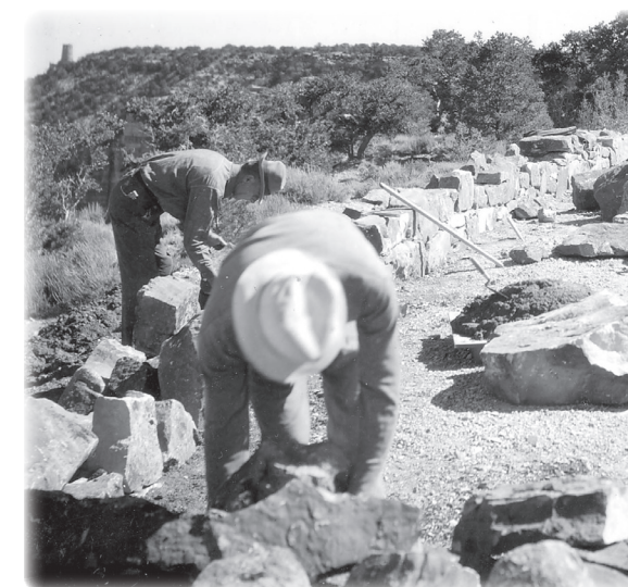
CCC “boys” at Navajo Point; note the Watchtower on the horizon

As you walk the path up the hill, reflect back to the men of the Civilian Conservation Corps (ccc) who lived and worked at Grand Canyon from 1935 to 1942. While living in barracks, they completed more than twenty projects at Desert View including trails, rock walls (below), roads, and buildings. Ccc crews built the stone-walled building on your left (2) in 1941 as a restroom. The crews’ attention to detail shows the pride they had in their accomplishments.