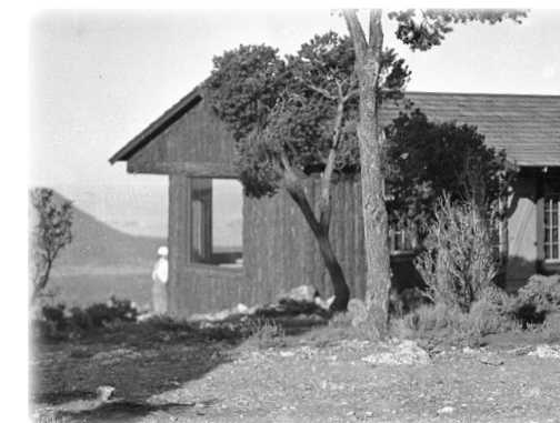
Caretaker’s Cabin in original location

On the left farther along the path, the house with two chimneys (3) (below) is the oldest building at Desert View. Originally constructed near the rim in 1927, it served as a place for visitors to rest, eat, and view the canyon. Following the construction of the Watchtower, it was moved to its current location and functioned as the caretaker’s cabin. It retains some of its original glass and exterior siding and stone work, and today is used as an office. Imagine all of today’s visitors trying to enter this building for tea!