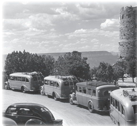
Fred Harvey buses at Desert View ca. 1938