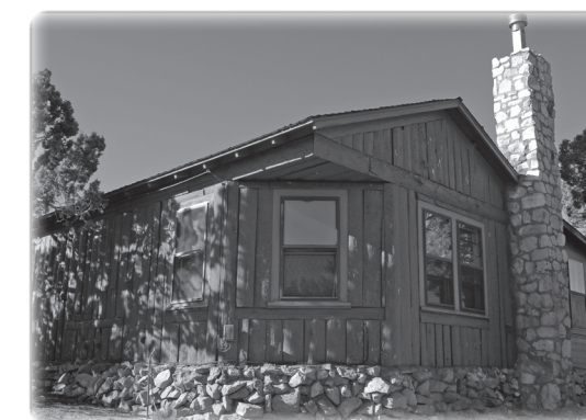
Caretaker’s Cabin today