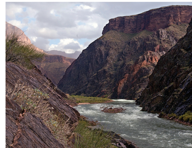
Vishnu basement rocks line the walls of the Inner Gorge.

Compared to the rocks exposed in its walls, Grand Canyon is geologically young. Excavation of the canyon occurred within the last six million years or so. The question of how the Colorado River evolved its present course is still unresolved, even though geologists have hypothesized for years about how the river first established its path across the plateau and carved this immense chasm. Much of the uncertainty regarding the exact age and history of the canyon centers on the reality that we have only scattered bits of evidence to reconstruct its history and to precisely date its origin. The history of the Colorado River is complex and will be the subject of geologic research for years to come.