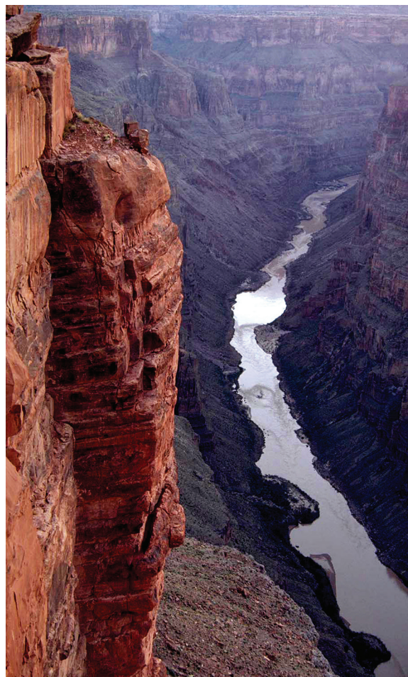
Toroweap Overlook in western Grand Canyon offers visitors a stunning view of the Colorado River.

The Colorado River flows 277 river miles (446 km) from Lees Ferry to the Grand Wash Cliffs, the accepted beginning and end of Grand Canyon. Hidden in the narrow Inner Gorge, the river is visible from only a few spots along the rim.