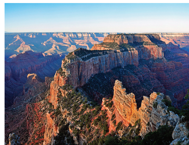
Expansive views from Cape Royal on the North Rim

The North Rim and the South Rim are only separated by ten miles (16 km) as the raven flies. Although it is not apparent, the north wall of the canyon rises a thousand feet (305 m) higher than the South Rim, giving the North Rim nearly twice the annual precipitation as South Rim. This considerable difference in elevation results from the fact that the apparently flat-lying rocks of the Kaibab Plateau are dipping gently to the south.