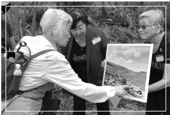
On site tours, historic photos are used to illustrate the World War II conditions (2016).