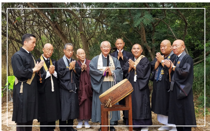
Obon ceremony to celebrate the finding of a taiko drum used at Honouliuli in 1944 (2017).