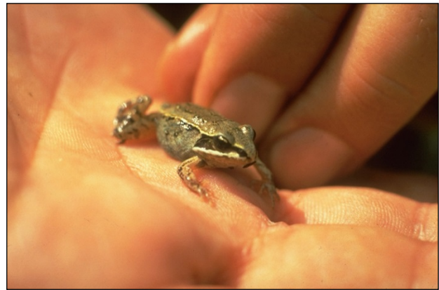
Wood frog – Rana sylvatica.

Through interpretation, park staff facilitate public understanding, appreciation, and protection of fish, wildlife, habitats, and management of diverse northwest Alaska ecosystems.