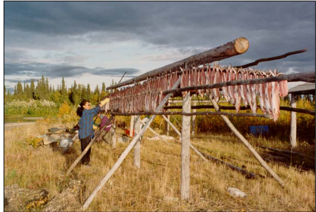
Drying whitefish along the Kobuk River.