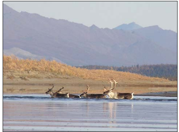
Caribou crossing the Kobuk River in autumn.