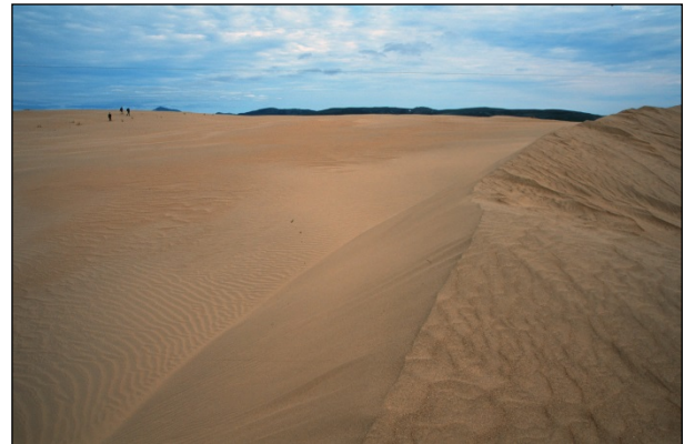
The Great Kobuk Sand Dunes.

Park staff facilitates public understanding, appreciation, and protection of all the elements of the ecosystem.