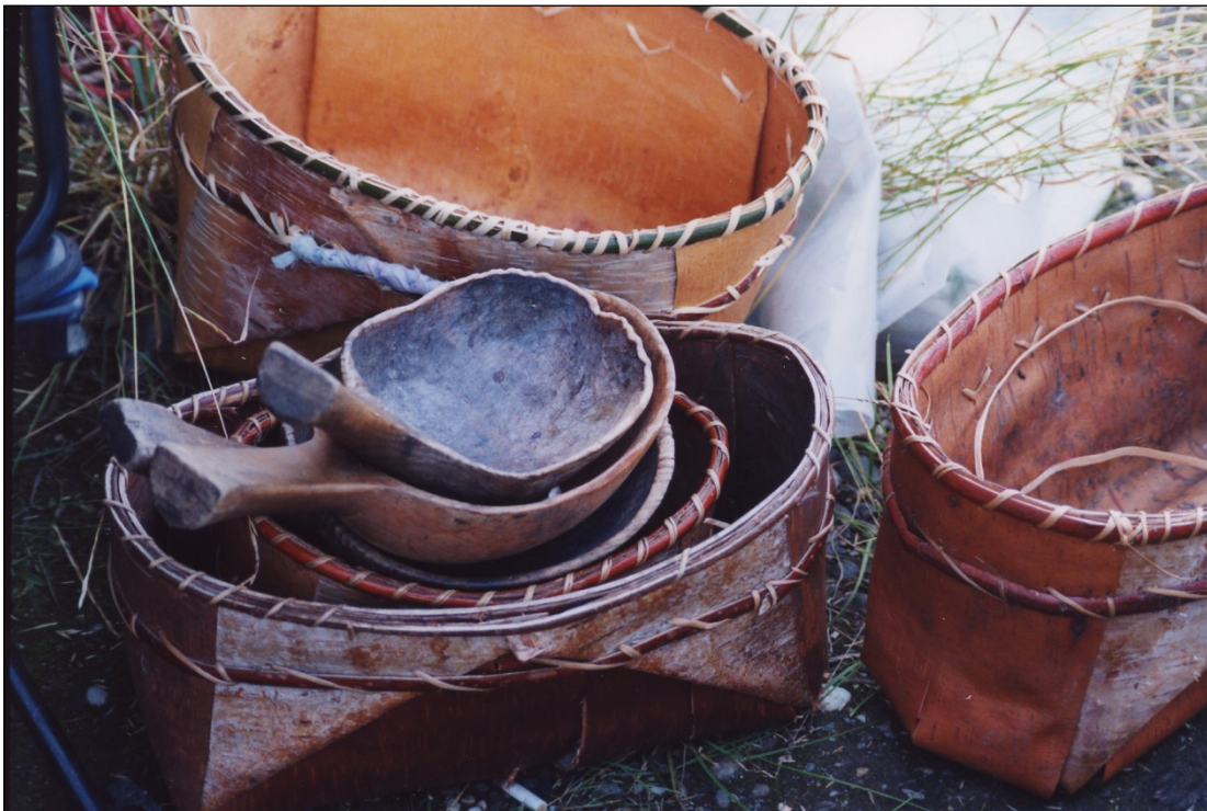
Birch bark baskets are a traditional craft of the Kobuk River region.