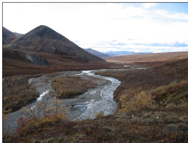
The upper Salmon River, a designated Wild River.