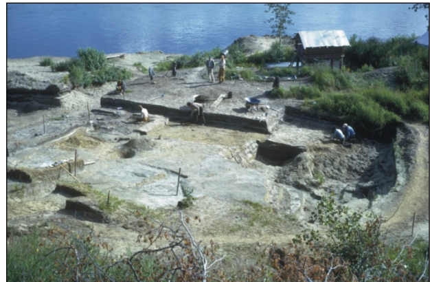
An archeological excavation at Onion Portage.