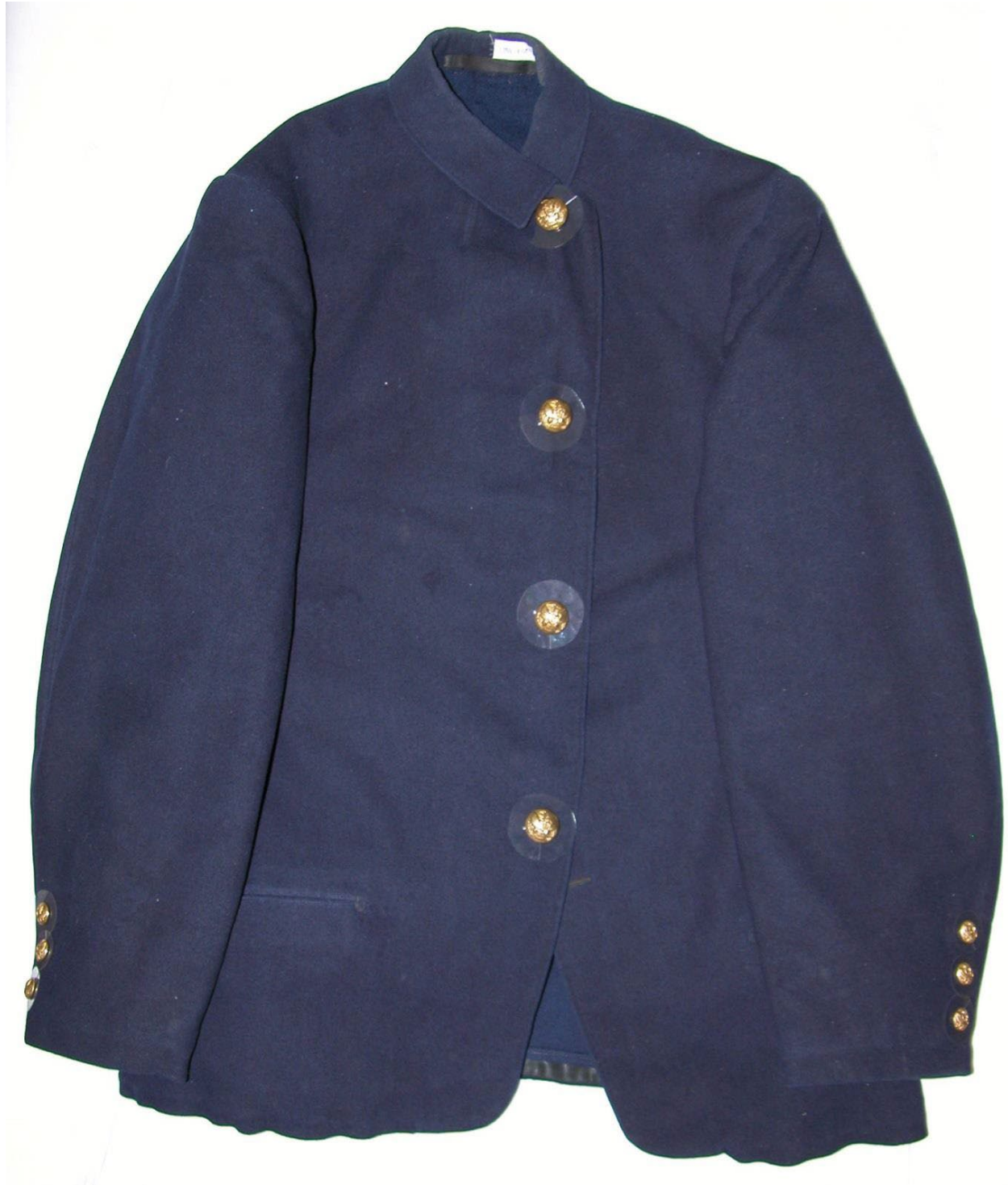
Charley Longfellow's Military Jacket (front)