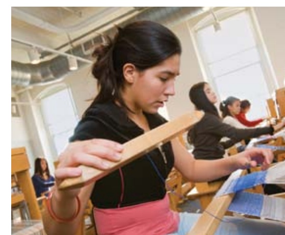
Clockwise from left: National Park System Advisory Board Education Committee as 'Workers on the Line'. Weaving in the 'Bale to Bolt' workshop. Students explore cultural artifacts in 'Yankees and Immigrants' program. Students discover the cotton gin.

Lowell's commitment to historic preservation is a model locally, nationally, and internationally.