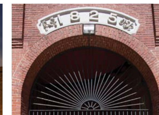
Appleton Mills continues its transformation with Lowell Community Health Center's new facility, while condominiums (shown below) are in the works at Boott Mills West.