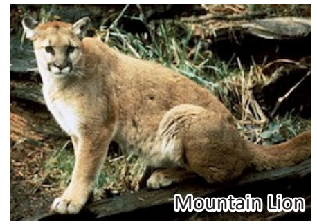
Mountain Lion

Tips for viewing viewing wildlife safely: