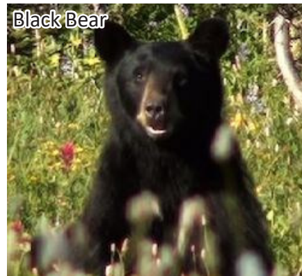
Black Bear