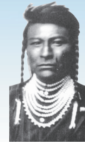
Chief White Bird

Over several days, our people arrive in small groups at Sitting Bull's camp near Fort Walsh, Canada. The Sioux believe the battle rages far away on the Missouri River. More refugees arrive. Finally, the Sioux understand the battle is only two days south on a tributary of the Milk River. With our warriors beside them, a band of Sioux starts south. Just past the 'Medicine Line' (the Canadian border), they encounter 30 of our people led by Chief White Bird. Our people who remained on Snake Creek have surrendered their weapons to the U.S. Army. They will suffer if rescue is attempted. Most of the relief party returns north with the new refugees. A few continue on to the place of battle to properly bury the dead.