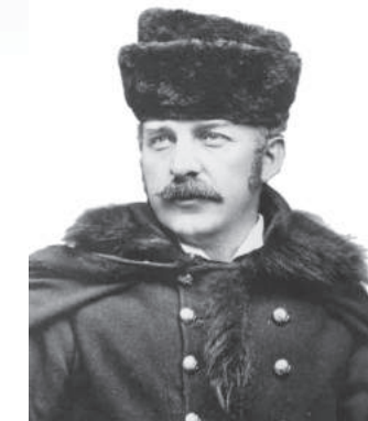
Colonel Nelson A. Miles

In a surprise attack at dawn on September 30, the soldiers stampede our horses. Less than 100 warriors defend our families against the charge of Colonel Nelson A. Miles' 400 troops and 50 scouts. Our warriors stop the army attack with heavy loss to both sides. Fearing the loss of too many men, Miles changes tactics and lays siege to our camp. Our camp is exposed to enemy fire. We are forced to seek shelter in pits dug into the frozen ground. Soldiers and Indians lay dead all around. Snipers prevent us from retrieving and burying our dead. We have been surrounded for four days and bombarded with cannon shells. Thirty of our people died this week. Some have fled during the battle and others are considering attempts to escape into Canada. When asked by Miles to end the fighting, our remaining leaders are unsure if they should trust the army.