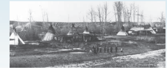
Joseph's winter encampment in Nespelem, Washington on the Colville Reservation, circa 1900.