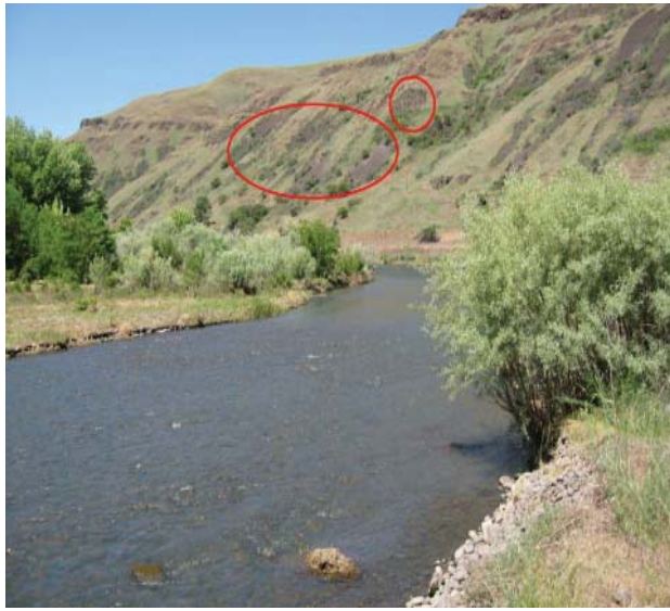
Basalt outcrops are evident throughout the canyon.