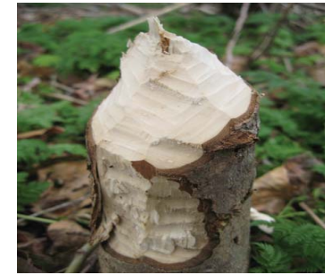
Evidence of beaver along Lapwai Creek.

Streams are dynamic; constantly changing their course and configuration. As you look across the stream from this spot you will notice an old stream