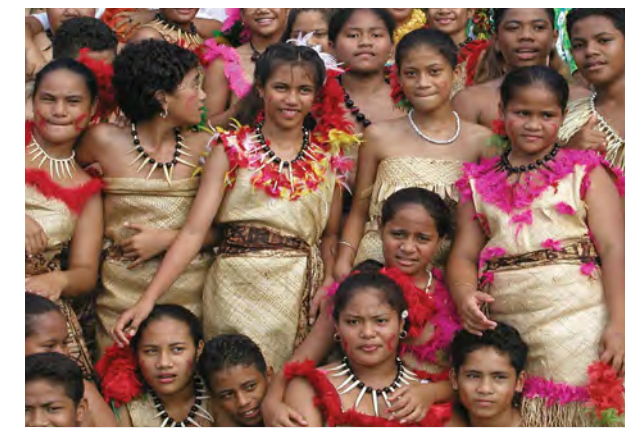
Samoa youth in their traditional clothing