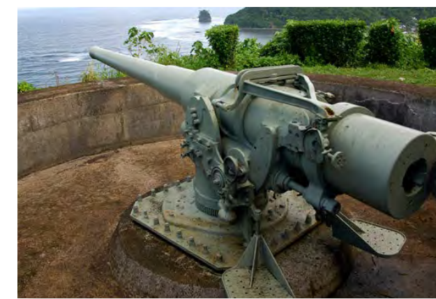
World War II cannon at Blunts Point