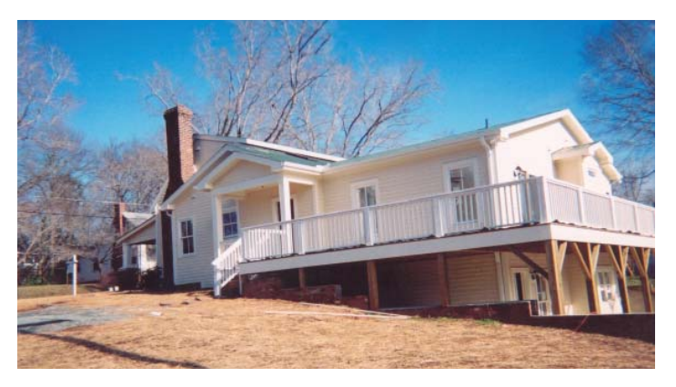
The size of this new rear addition—incorporating two floors and an extended depth--combined with substantial changes to the site overwhelm the modest historic house.

When the project began, the existing rear additions were determined to be beyond repair and were demolished. A replacement addition of a similar size to those removed would likely have met the Standards. However, the new addition constructed on the rear doubled the size of the structure as it existed before the rehabilitation. As built, the cladding, openings, and rooflines of the new addition were appropriate to the building's historic character. Yet this was not sufficient to overcome the effect of an addition substantially more massive than the additions that were demolished. With two full floors, a footprint that was much deeper than the previous additions, a new deck extending from the rear and side elevations, and significant grade changes at the rear, this work competes for attention with the historic structure to which it is attached and has seriously impacted the property's historic character.