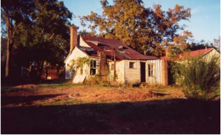
Top and Above: This historic house had been altered numerous times in the past--including multiple additions to the rear of the building.