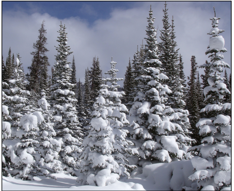
Heavy, spring snow blankets the evergreen trees in RMNP on a winter day.

In contrast, evergreen trees such as lodgepole pine and subalpine fir have needle-like leaves, produce cones, and do not lose their leaves in the fall. Pine, fir, and spruce trees have a tapering shape which enables them to easily bear snow by distributing weight evenly among the branches. Not only does branch distribution help shed snow, needle shape is imperative in winter as well. Consider their thin needle-like shape, in contrast to the broad flat shape of the leaves of deciduous trees: needles are modified leaves which improve the ability of the tree to shed snow. Evergreen needles also have a thin waxy coating which enables