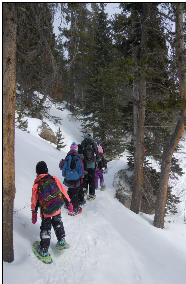
Students explore the winter world of the park while snowshoeing near Bear Lake.

Along with the Ten Essentials, it is important to be prepared for backcountry travel in the park in all types of weather and conditions. Winter conditions can change rapidly and in unforeseen circumstances knowledge of these conditions is imperative.