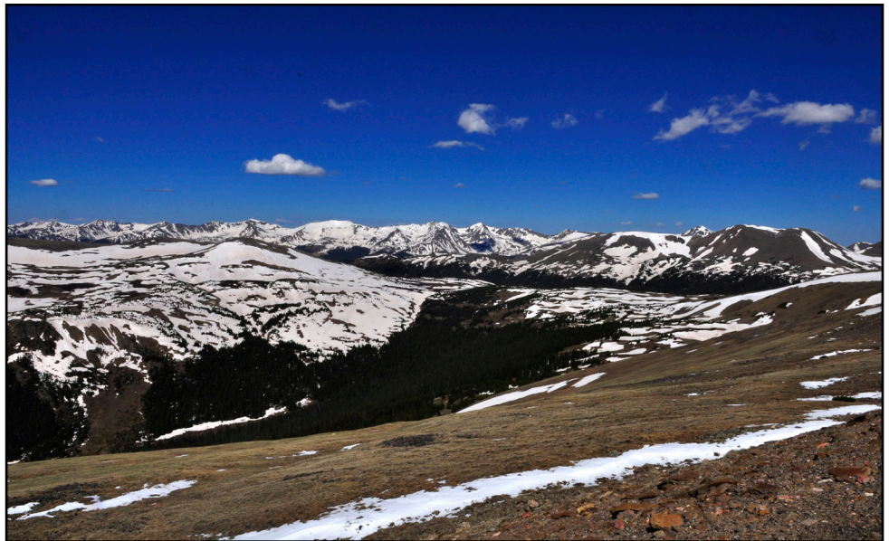
The snowcapped view from Trail Ridge Road of Forest Canyon below where the headwaters of the Big Thompson River begin.

Snowpack is Colorado's key water reservoir because it traps water in a frozen state and slowly releases it throughout the year; however, the air content in a layer of fresh snow can be as much as 97%, providing little to no usable water. If all precipitation came in the form of rain, the water would quickly be lost to ground infiltration and flooding; in Colorado 80% of all precipitation evaporates, sublimates, or transpires from plants.