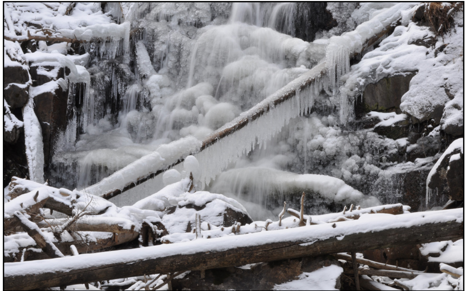
Spring ice and snow at Fern Falls demonstrates the unpredictable and snow laden storms that provide a majority of Colorado's precipitation.

In the backcountry of the park hypothermia is a condition to be aware of since conditions can change rapidly. Hypothermia occurs when the body loses heat faster than it can produce it, causing dangerously low body temperature. As body temperature drops, the heart, nervous system, and other organs are not able to function properly. Often someone experiencing hypothermia is not aware of their condition because symptoms begin gradually and their confused state hinders self-awareness. Because symptoms begin slowly, and if left untreated the condition can become severe, it is important to become familiar with the signs and symptoms of hypothermia. The four main signs of hypothermia can be easily remembered using the mnemonic device “umbles”. These signs include: stumbles, mumbles, fumbles, and grumbles. These signs indicate changes in motor coordination and levels of consciousness.