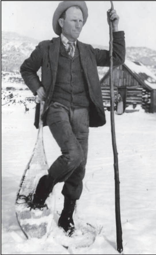
Enos Mills, one of the founding fathers of RMNP, is pictured snowshoeing near his mountain cabin.

Over the years, humans have developed many strategies and adaptations to survive harsh winter conditions. Historically, the story of winter survival for humans is one of migration and toleration. Native American tribes such as the Ute and Arapahoe followed the seasonal migration of animals from the area which is now RMNP to the Great Plains during the winter months; this nomadic lifestyle enabled them to have an abundant food resource and seek shelter from the harsh Colorado winters.