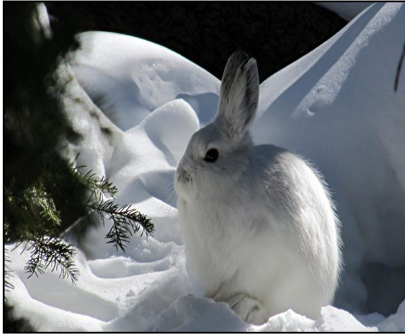
Snowshoe hare in winter fur.

Consider a top layer of snow that is deep and airy, in contrast to a compacted top layer of snow. Animals such as fox, coyotes, and mule deer are not well adapted for movement in deep airy snow – the distribution of their body weight and small surface area of their feet mean movement is not efficient and can make catching prey difficult. However, animals such as the snowshoe hare are specifically adapted to move across deep airy snow effortlessly because of their light body weight and feet which are built to distribute weight evenly across the snowpack.