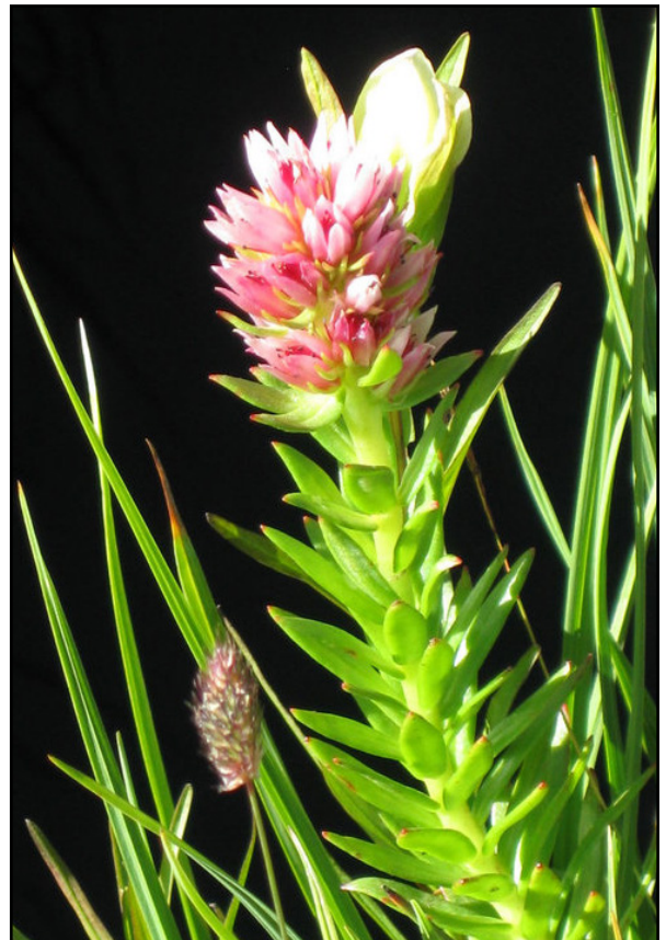
Rose crown growing near Thunder Lake.

The flora of the park also have developed many adaptations to help them survive harsh winter conditions in the Rocky Mountains. Near the end of summer and beginning of fall, plants begin to prepare for the winter months. Perennials such as rose crown, lupine, and the pasque flower survive winter; the above ground portion of the plant will die back each year, but they retain an active root system through the winter, protected by layers of snow, and the plant is able to grow back in the spring. The common evening primrose, red clover, and western wallflower are all biennials in the park; during the first winter they will die off, retaining an active root system, and come back for a second growing season, producing seeds to ensure survival. Annuals in the park, such as moss gentian, have only one growing season which means they will produce many flowers and seeds which fall to the ground and germinate the next year. These specific plant characteristics and adaptations are influenced by the seasonal variations in climate as well as habitat which all comprise individual plant phenology.