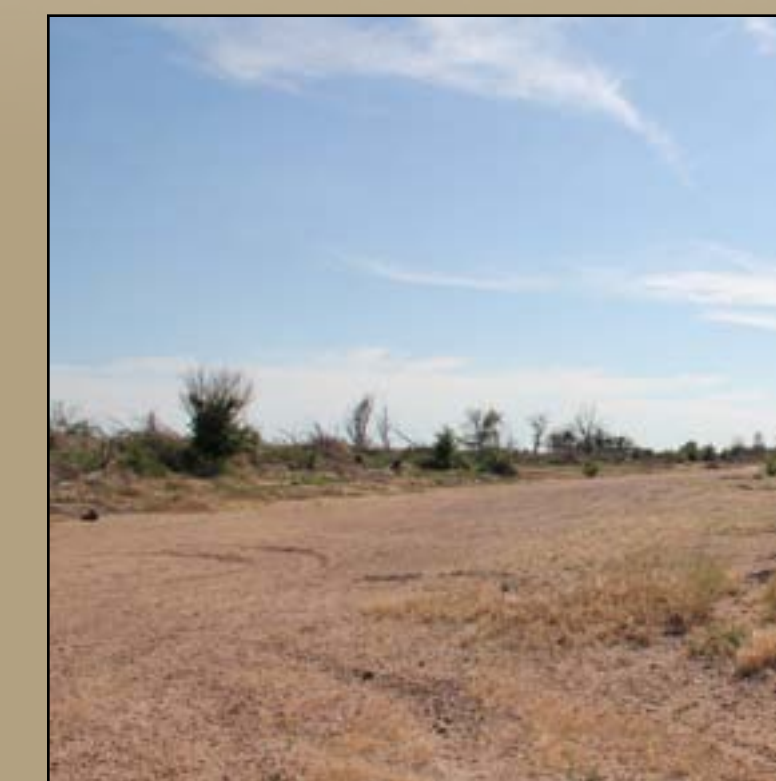
Cimarron Crossing Park

American Indians viewed settlements such as the ranch as intrusions onto their homelands. Tension between settlers, traders, and the military increased, including an attack on a wagon train crossing here in June 1867.