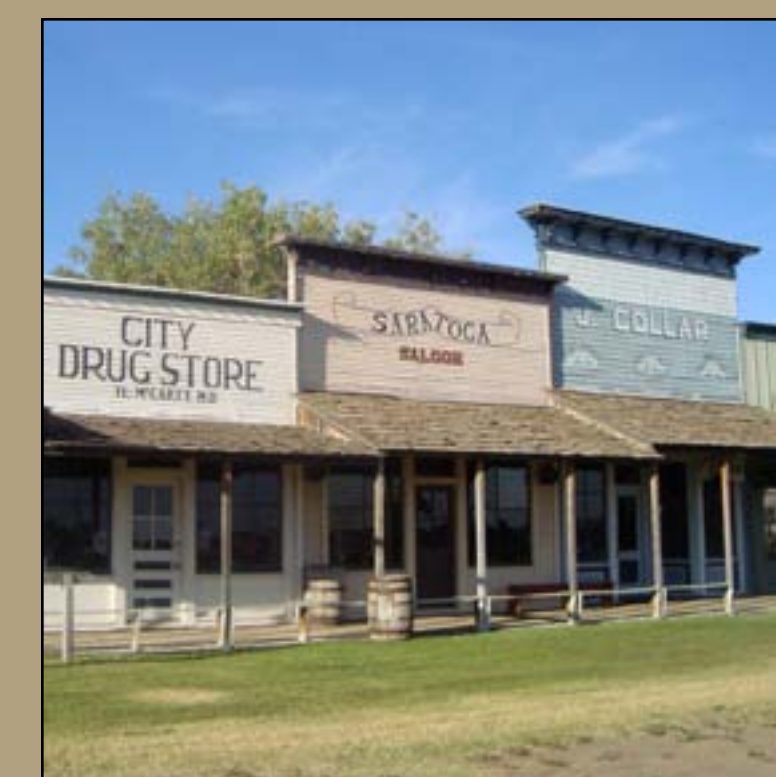
Boot Hill Museum

The Arkansas River played an important role in the history of the Santa Fe Trail. From water source to borderland, it has changed as much as the land around it. Today the riverbed is dry, but during the trail era, it was a difficult crossing.