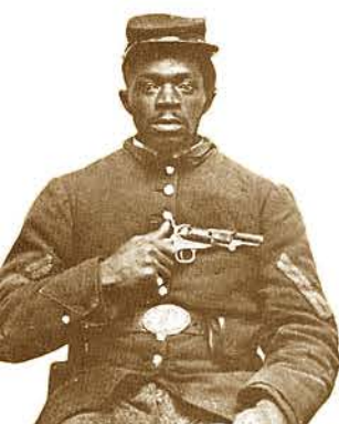
Nearly 200,000 African American soldiers and sailors served in the U.S. military during the Civil War.