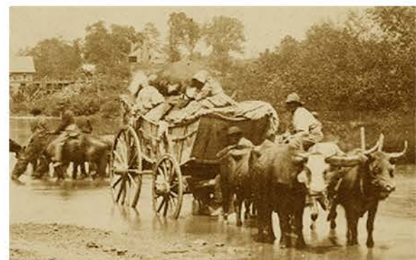
Contraband slaves fleeing Confederate forces in Virginia.

them, and placed them in charge of security at the newly organized contraband camp for the refugees on the northeast side of Corinth.