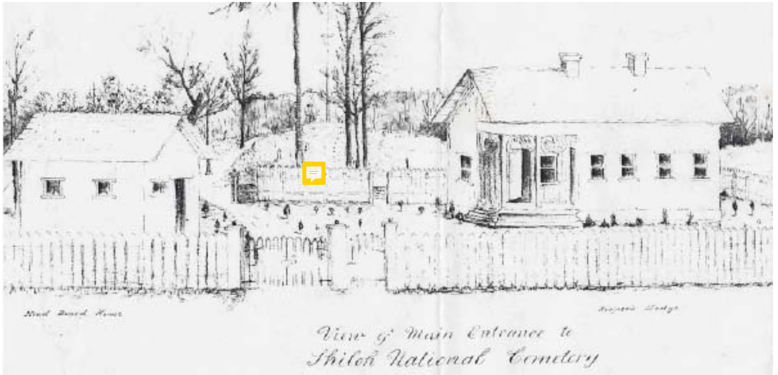
1867 View of the National Cemetery