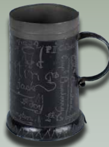
During the War of 1812, painted hat plates were sometimes attached to soldiers' hats to designate military units. The canteen and mug shown above were both used by American soldiers during the Battle for Baltimore.

Coupled with an American victory on Lake Champlain, the end of the war was in sight. The United States and Britain agreed upon the Treaty of Ghent in December. However, they did not ratify the treaty until shortly after the Battle of New Orleans, officially ending the war on February 17, 1815.