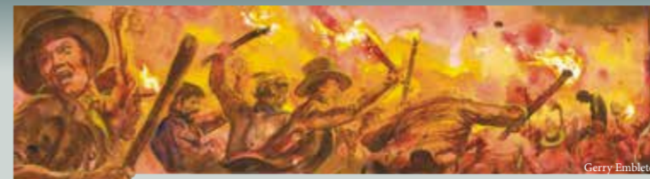
Riots erupted in Baltimore in response to an anti-war newspaper.

On June 18, 1812, Congress finally declared war, but Americans continued to argue over the course of the nation. In Baltimore, a pro-war mob destroyed the offices of an anti-war newspaper, igniting riots that left dead and wounded in their wake.