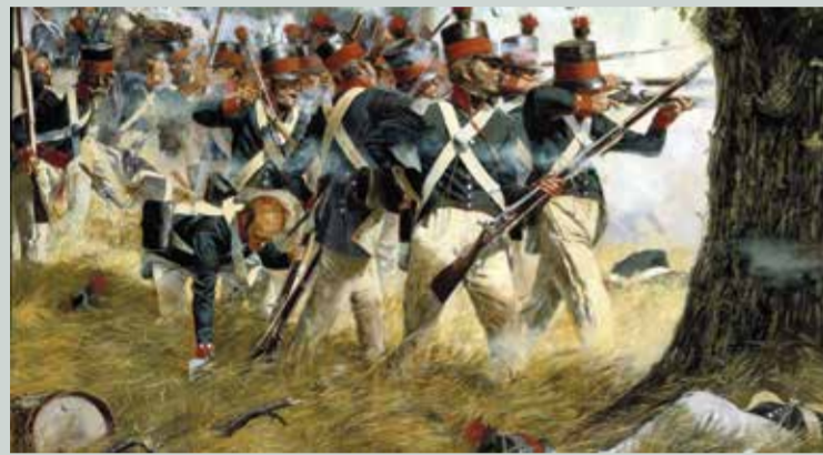
Maryland militia at the Battle of North Point.

In 1812, the United States of America was less than 30 years old, and only one generation had been raised to adulthood under the American flag. Many people still personally remembered the daring and exhausting fight to win independence from Britain, pitting 13 allied colonies against the largest military force in the world.