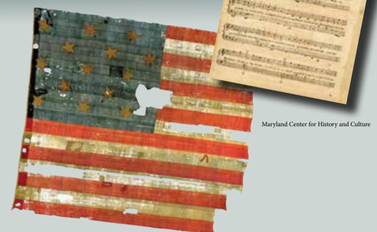
Maryland Center for History and Culture

Over the next two years, British and American conflicts erupted from the Great Lakes to the Gulf of Mexico. By the time the fighting ended, the war had propelled America into greater maturity as a nation. Having been tested against a world superpower, the states were now more truly "united." Americans felt a stronger sense of collective identity and greater commitment to a robust, national military. By defending rights at sea and expansionist goals at home, America confirmed its entry on the international stage.