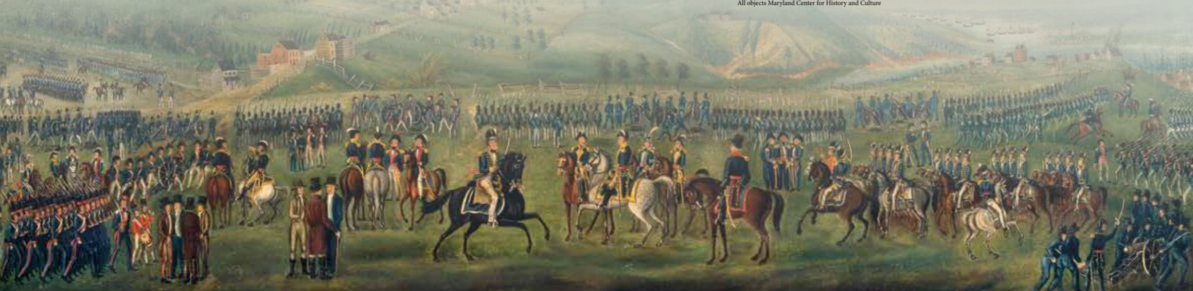
Assembly of troops on Hampstead Hill