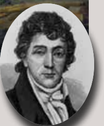
Francis Scott Key

American lawyer Francis Scott Key watched the bombardment of Fort MCHenry from a ship in the Patapsco River. Key was helping to negotiate the freedom of an American doctor, held captive on a British ship. The British prevented the Americans from leaving until after the attack, and Key spent an anxious night watching it take place. The experience inspired him to write patriotic lyrics for a popular, existing melody. The resulting words and tune became America's national anthem in 1931.