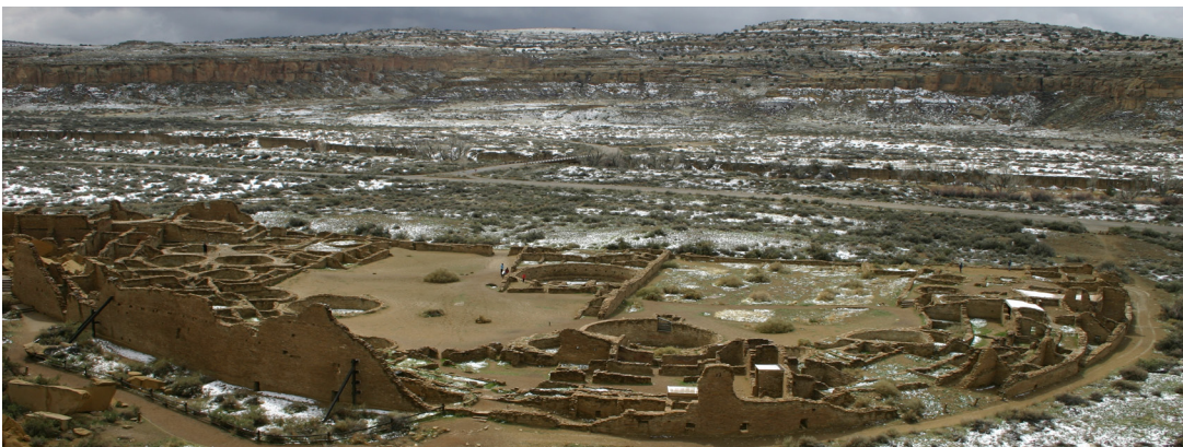
Pueblo Bonito with a light dusting of snow at Chaco Culture NHP.