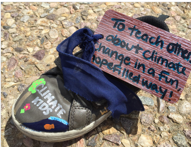
Recycled shoe used as a planter for a native coastal plant. One of the many outreach products from Cabrillo National Monument's Climate Kids program.

Alexandria Warneke alexandria_warneke@nps.gov