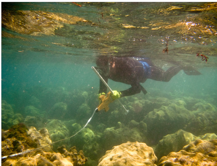
Scientists in Alaska deploying a sonde to determine the conductivity, temperature, and depth of the ocean.