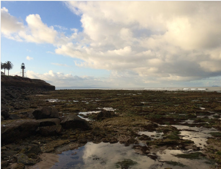
Cabrillo National Monument intertidal zone featuring the iconic lighthouse. This particular stretch of coastline is the section set aside for preservation and research purposes only.