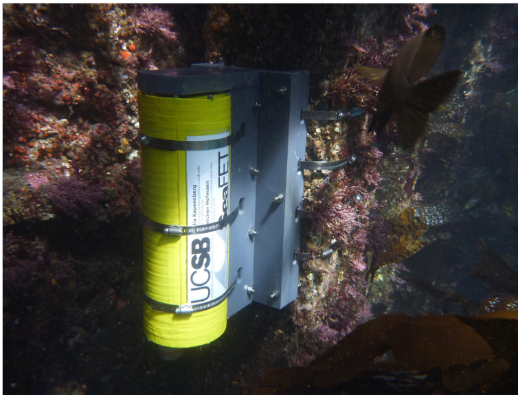
SeaFET ocean pH sensor deployed on the pier at Anacapa Island.