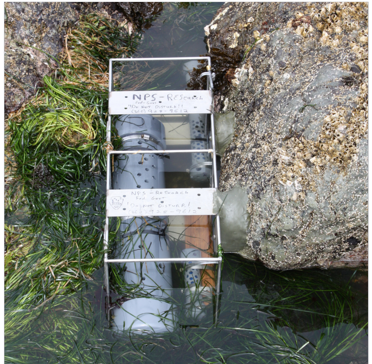
The OA monitoring instrument package installed in a tidepool in the American Camp unit of SAJH.