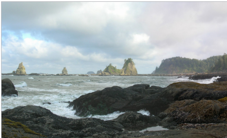
The wave-swept rocky intertidal zone of the outer Olympic coast at Sokol Point.