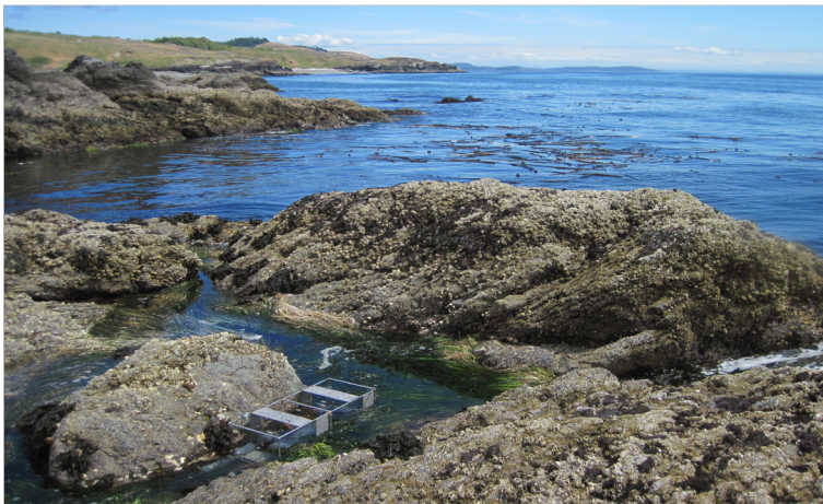
Overview of the SAJH intertidal zone with the OA monitoring package.