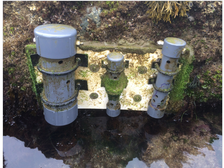
Installation of sea level pressure transducer (left), conductivity sensor (middle), and dissolved oxygen sensor (right) during low tide. Together, these instruments provide additional climate change data that complement the ocean acidification monitoring program.