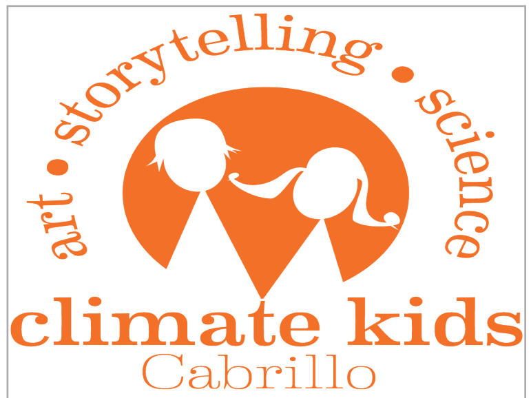
Logo for the climate kids program at Cabrillo National Monument. Logo courtesy of Alexandria Warneke.