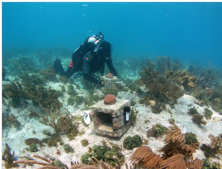
USGS diver working on the calcification blocks at Biscayne NP. A temperature logger is seen on the block in the foreground.