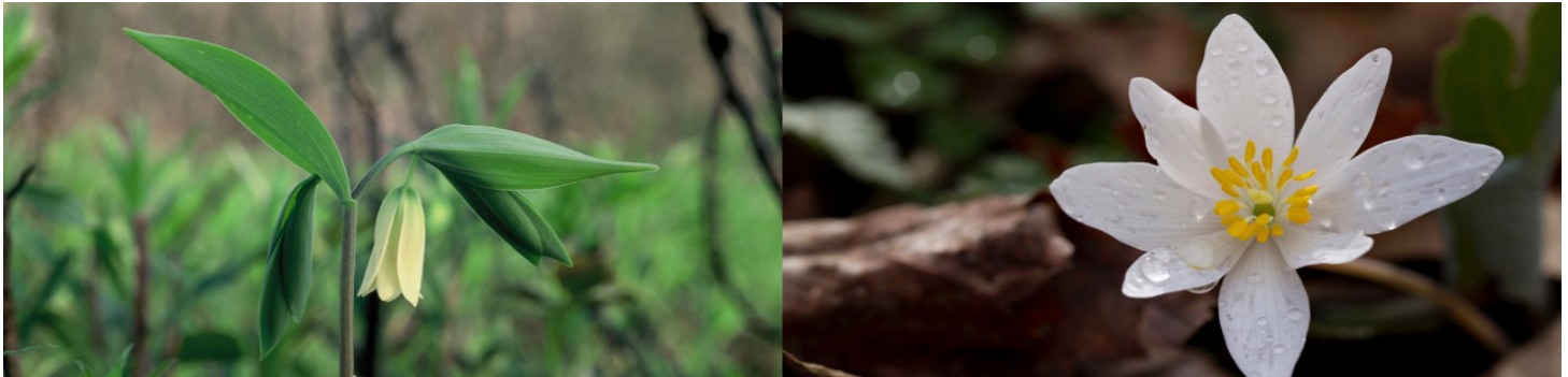
Leaves unfurling and blossoms opening in spring at Shenandoah National Park.