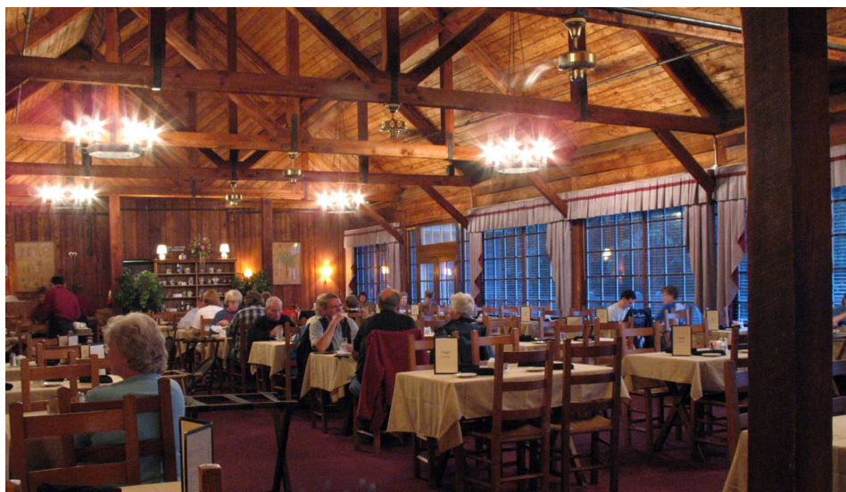
Pictured: Big Meadows Lodge Dining