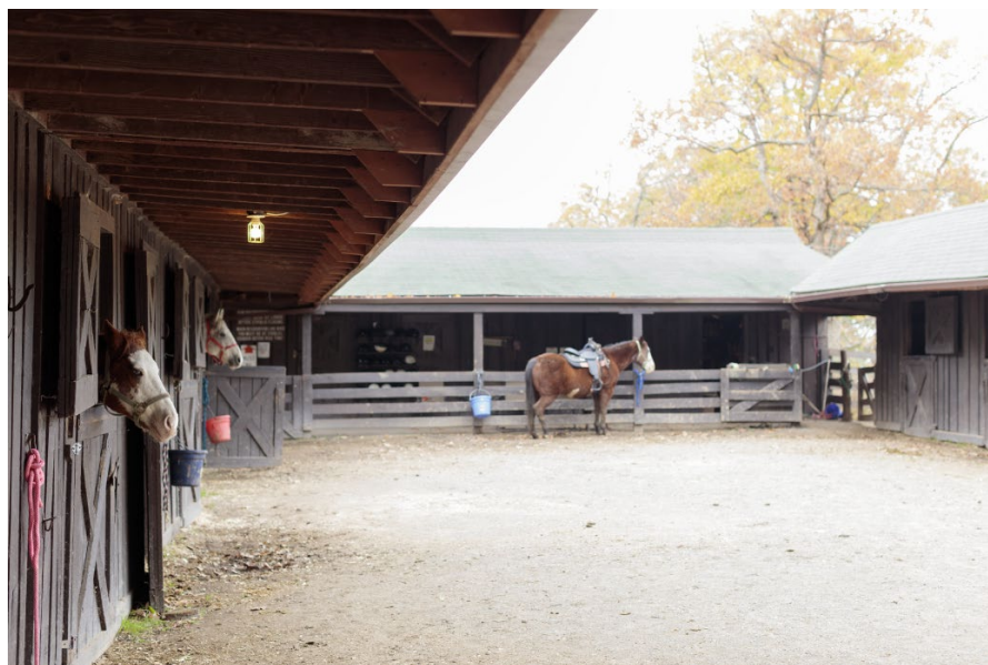
Pictured: Skyland Stables

Skyland Stables, but must stable no more than four ponies. No all-day or overnight rides are authorized. Wagon rides may be authorized with prior approval by the Superintendent.