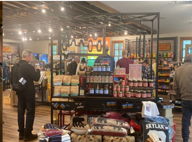
Pictured: Big Meadows Lobby