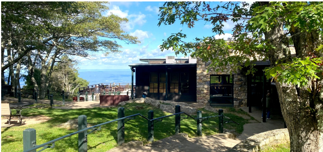
Pictured: Skyland Resort Building

Secondary Selection Factor 2 requires Offerors to describe how they will improve the visitor experience in the Park campgrounds.