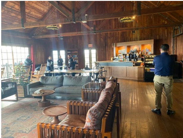
Pictured: Big Skyland Resort Gift Shop

For this opportunity, the Draft Contract requires the Concessioner to operate lodging in three locations, a mix of quick service, fast-casual, and family casual food operations at multiple locations, retail services at multiple locations, campgrounds and accompanying amenities (shower/laundry), and offer automotive fuel services at Big Meadows Wayside. In addition, the Draft Contract requires the Concessioner to offer horseback riding at the Skyland Stables.