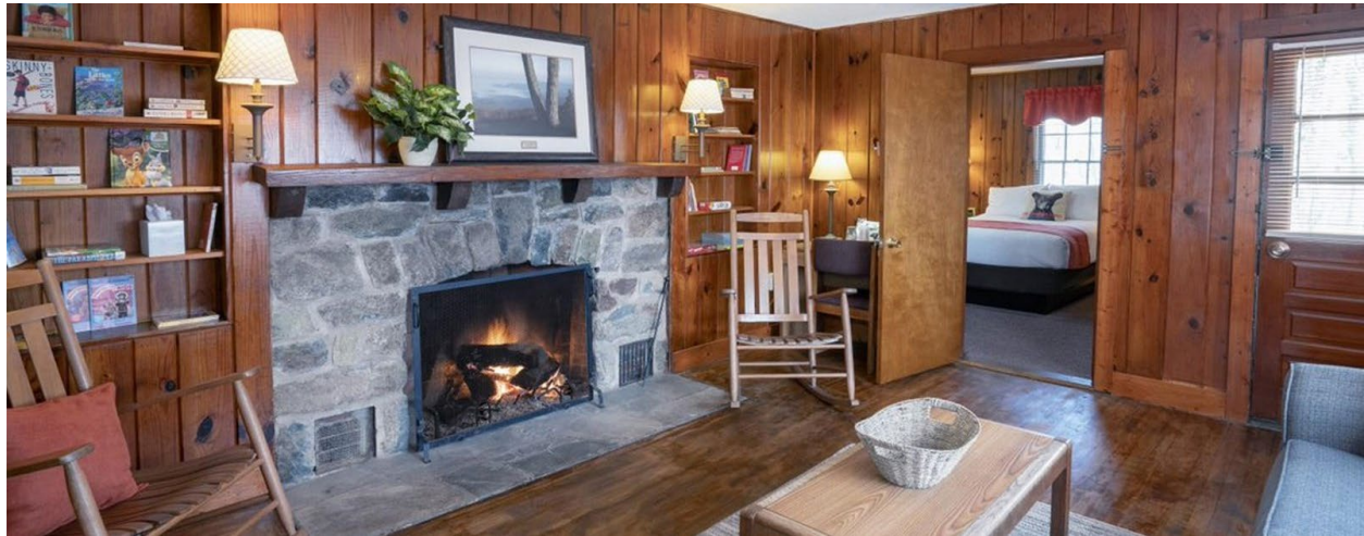
Pictured: Big Meadows Lodge Accommodation