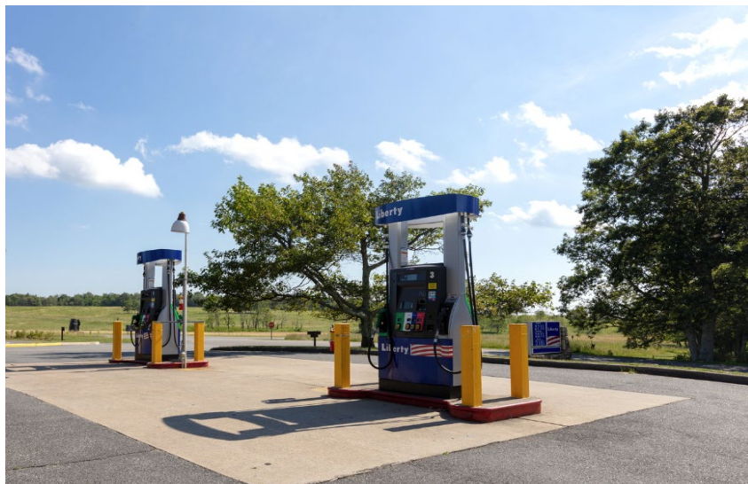
Pictured: Gas Pumps at Big Meadows Wayside

supply fuel to this location. The pumps must operate 24 hours per day, seven days per week while the Big Meadows Wayside is open.