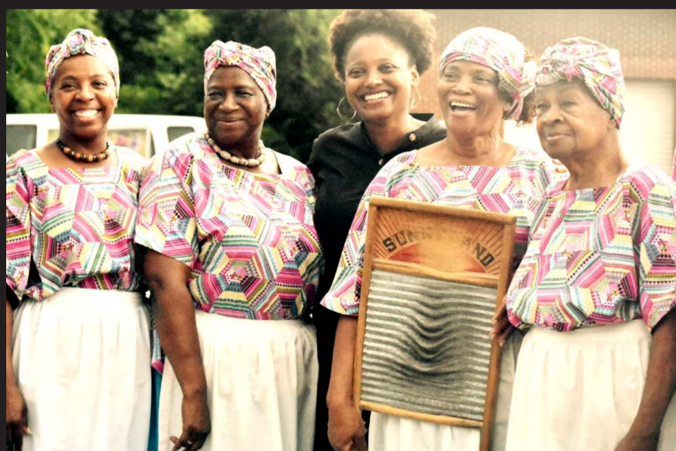
Gullah Geechee Cultural Heritage Corridor