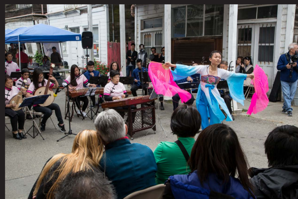
Sacramento-San Joaquin Delta National Heritage Area