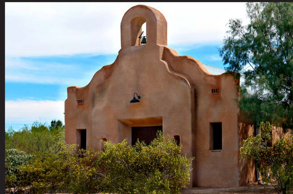
Northern Rio Grande National Heritage Area