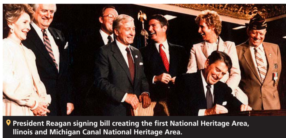
President Reagan signing bill creating the first National Heritage Area, Illinois and Michigan Canal National Heritage Area.

In 1984, President Reagan signed legislation establishing the first national heritage area. It was a new concept that married preservation, conservation, recreation, education, and economic development. Over the next decades, the number of NHAs grew through various legislation. In January 2023, President Biden signed the National Heritage Areas Act, landmark legislation establishing a system of NHAs and standardizing NPS administration of NHAs to ensure consistency and accountability across the NHA System.