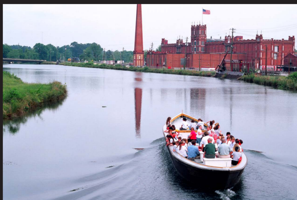
Augusta Canal National Heritage Area