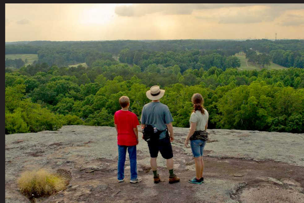
Arabia Mountain National Heritage Area

Congress makes funds available to NHAs through the NPS Heritage Partnership Program (HPP). Each NHA typically receives annual funding ranging from $150,000–$710,000. NHAs match the funds with nonfederal in-kind or cash sources. While NHA designation is permanent, funding from the NPS is authorized for a limited amount and number of years.