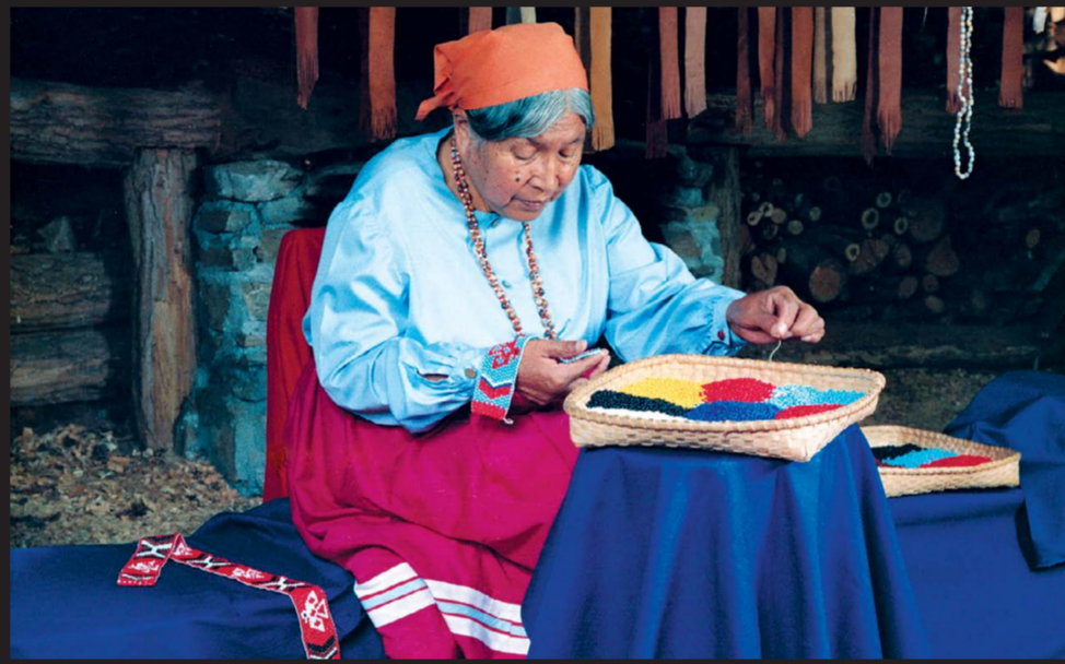
Cherokee artisan in the Blue Ridge National Heritage Area