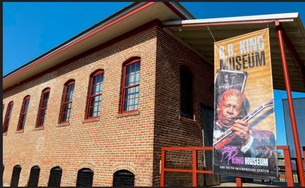
Indianola, MS, houses the BB King Museum and Delta Interpretive Center in the Mississippi Delta National Heritage Area